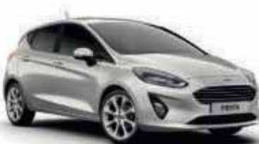
Moondust Silver Premium body colour*