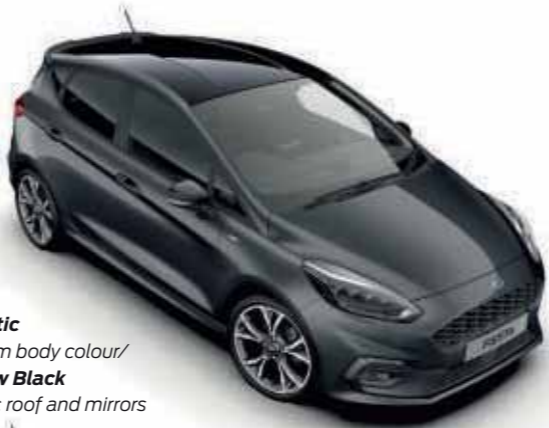
Magnetic Premium body colour/ Shadow Black Metallic roof and mirrors