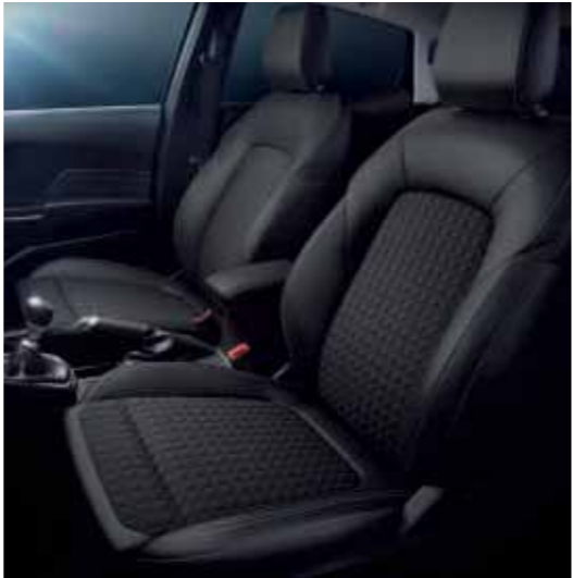
Salerno Leather/Flagstone In Ebony for Titanium X