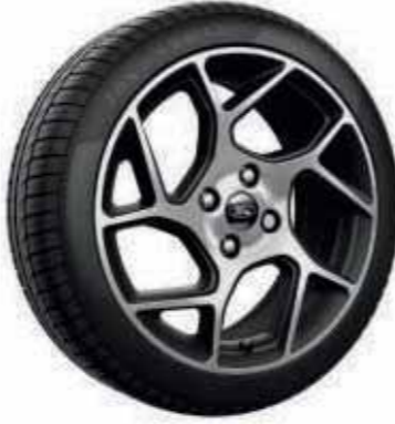
17" 5x2-spoke ST Matt Black machined-finish alloy wheel (Standard on ST-2)