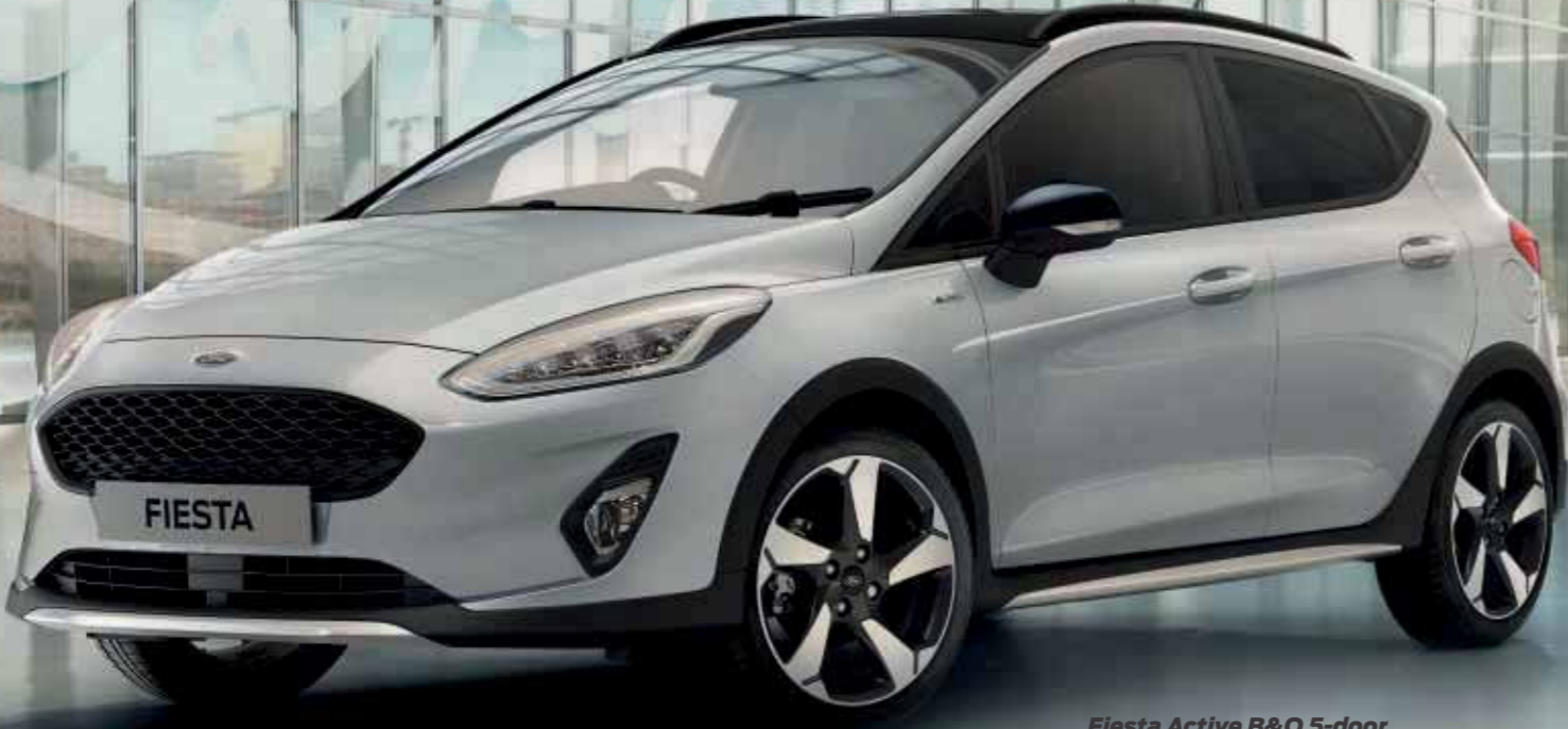
Fiesta Active B&O 5-door with 17" alloy wheels, plus optional Moondust Silver premium body colour, with contrasting roof and door mirrors in Shadow Black.