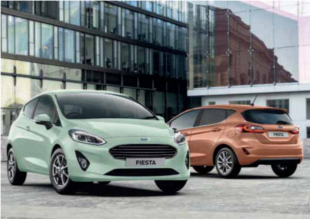
Interior model shown is B&O PLAY Titanium in Chrome Copper body colour

For Engine availability see Zetec and Titanium series