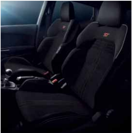
Gozil In Ebony/Silver for ST-1