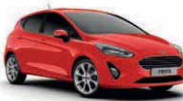
Race Red Standard body colour