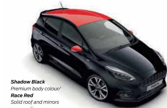
Shadow Black Premium body colour/ Race Red Solid roof and mirrors

Create your perfect Fiesta. Choose your favourite colour combination from a range of contrasting body colour, roof and door mirror options available. (Optional on Titanium, Titanium X, Active 1, Active X, ST-Line and ST-Line X)