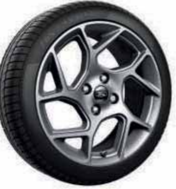
17" 5x2-spoke ST Flash Grey alloy wheel (Standard on ST-1)