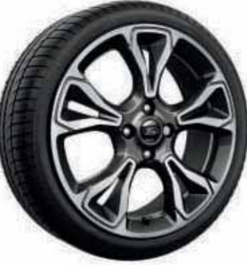
18" 5x2-spoke ST-Line unique Rock Metallic/Machined alloy wheel (Option on ST-Line and ST-Line X)