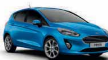
Desert Island Blue * Exclusive body colour*