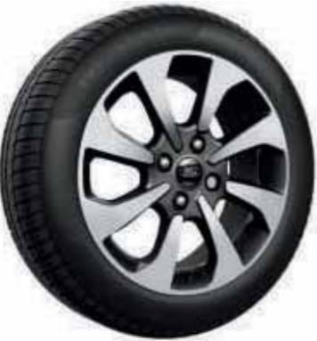
16" 8-spoke, Rock Metallic alloy wheel (Option on Zetec, B&O Zetec, Titanium, B&O Titanium and Titanium X within the 16" Style Pack)