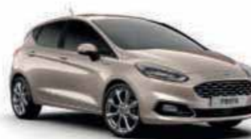
Milano Grigio † Exclusive to Vignale body colour*