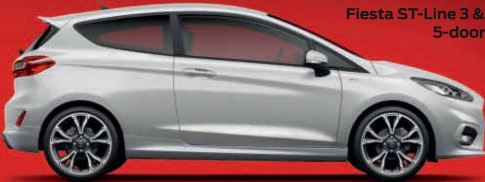
Fiesta ST-Line 3 & 5-door

Width: 1735 mm† Width (with mirrors): 1941 mm†