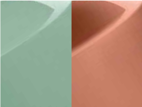
■ B&O Series exclusive body colours (Standard)

Note see Active series pages for details of Fiesta Active B&O