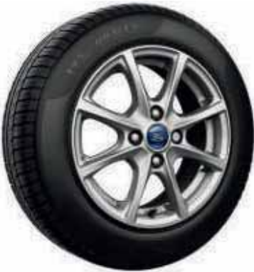
15" 8-spoke, Sparkle Silver alloy wheel (Standard on Zetec and B&O Zetec)