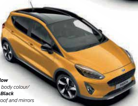
Luxe Yellow Exclusive body colour/ Shadow Black Metallic roof and mirrors