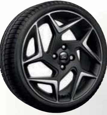
18" 5x2-spoke ST Magnetic machined-finish alloy wheel (Standard on ST-3. Option on ST-2)