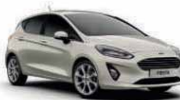
Metropolis White * Exclusive body colour*