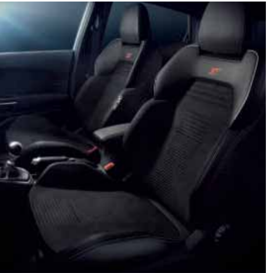
Acceleration Partial leather in Black Dinamica for ST-3