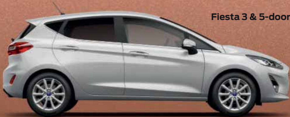
Fiesta 3 & 5-door

Width: 1735 mm† Width (with mirrors): 1941 mm†