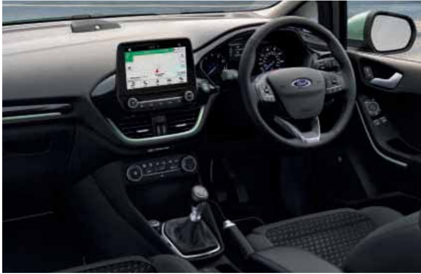
B&O Series Bohai Bay Mint interior Standard on B&O Zetec and Titanium Bohai Bay Mint series