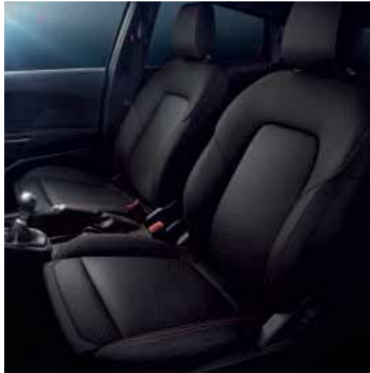
Court In Ebony for ST-Line

The look and feel of premium materials will enhance your appreciation of the Fiesta's stunning interior. Sumptuous front seats provide outstanding comfort and support, while great care has been taken in designing and crafting trims for your Ford Fiesta, to further elevate the overall driving experience.