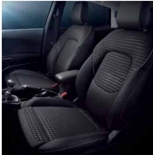
Elow/Domo In Ebony for Zetec, Titanium and the B&O Series