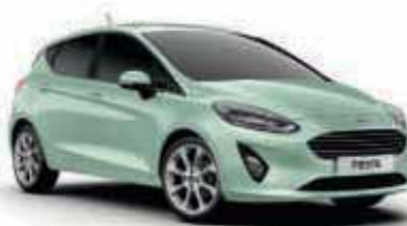
Bohai Bay Mint o Exclusive to B&O Zetec & Titanium series body colour*