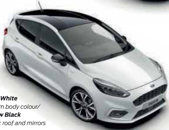
Frozen White Premium body colour/ Shadow Black Metallic roof and mirrors