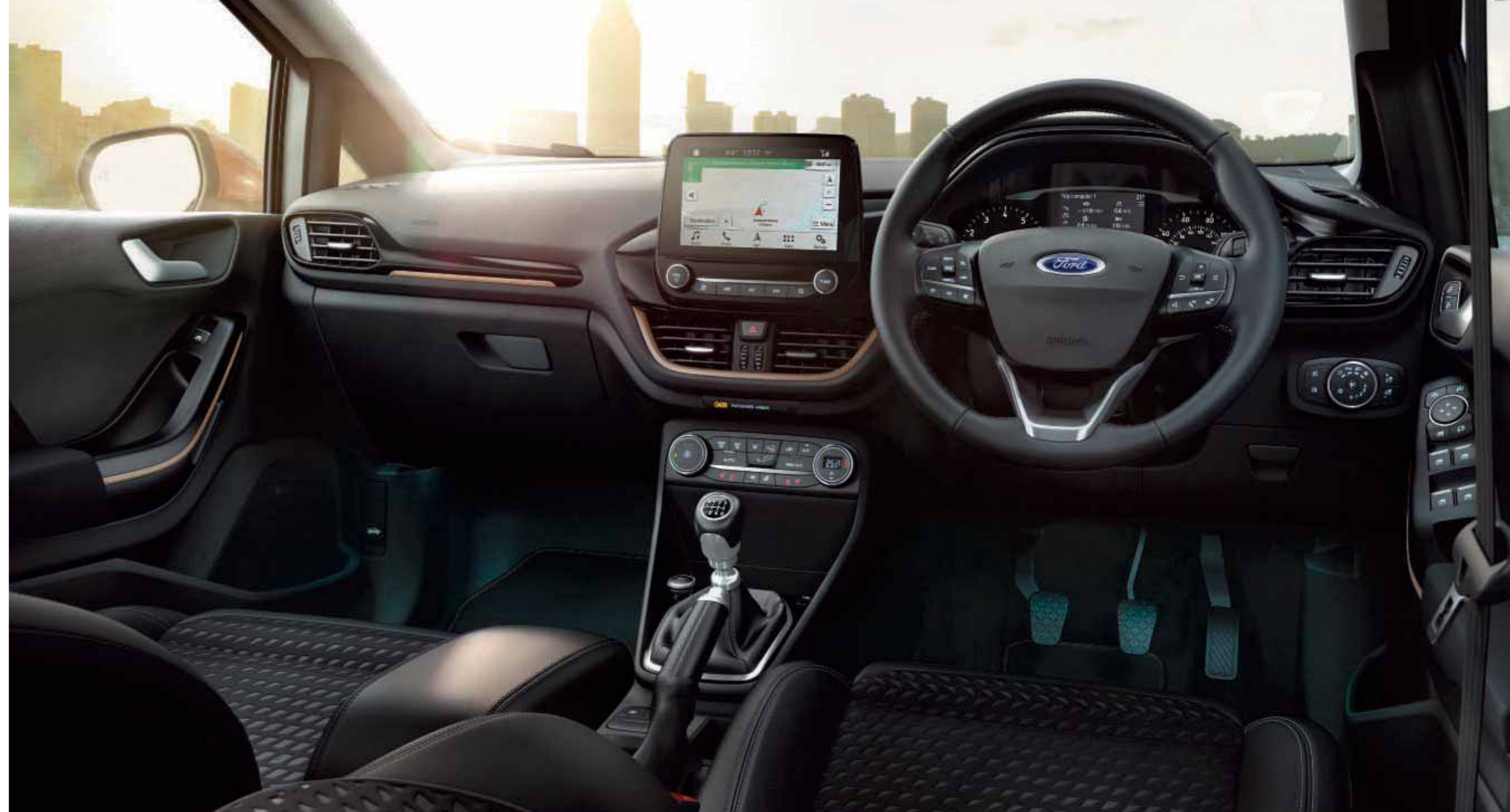
Ford Fiesta Titanium B&O Edition with Copper interior personalisation pack.

Your individuality can also be reflected through an assortment of interior design flourishes that match selected exterior colours. Contrast stitching on seat trims, steering wheel and floor mats; as well as coloured accents across the instrument panel, centre console and interior door handles, all complement unique exterior body colours on selected models.