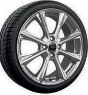
18" 8-spoke Vignale unique Polished alloy wheel (Option on Vignale)