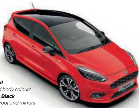
Race Red Standard body colour/ Shadow Black Metallic roof and mirrors