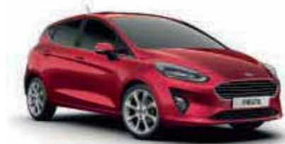
Ruby Red Exclusive body colour*