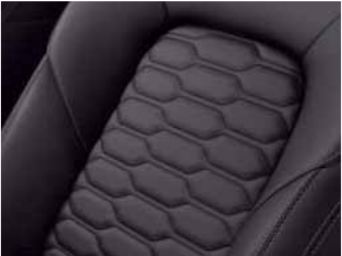
■ Vignale Black Ruby leather seat trim (Standard)