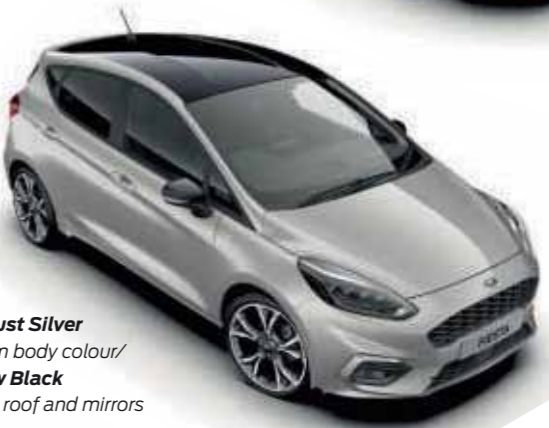
Moondust Silver Premium body colour/ Shadow Black Metallic roof and mirrors