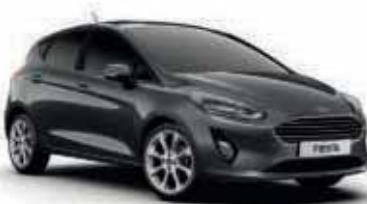
Magnetic Premium body colour*