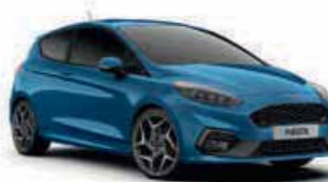
Ford Performance Blue Exclusive to ST body colour*