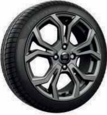
17" 5x2-spoke ST-Line unique Rock Metallic alloy wheel (Standard on ST-Line and ST-Line X)