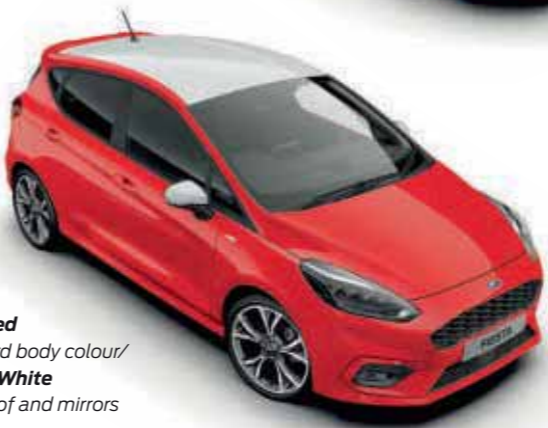
Race Red Standard body colour/ Frozen White Solid roof and mirrors