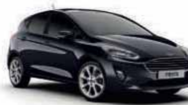
Shadow Black Premium body colour*