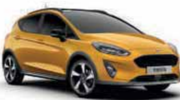
Luxe Yellow Exclusive to Active body colour*