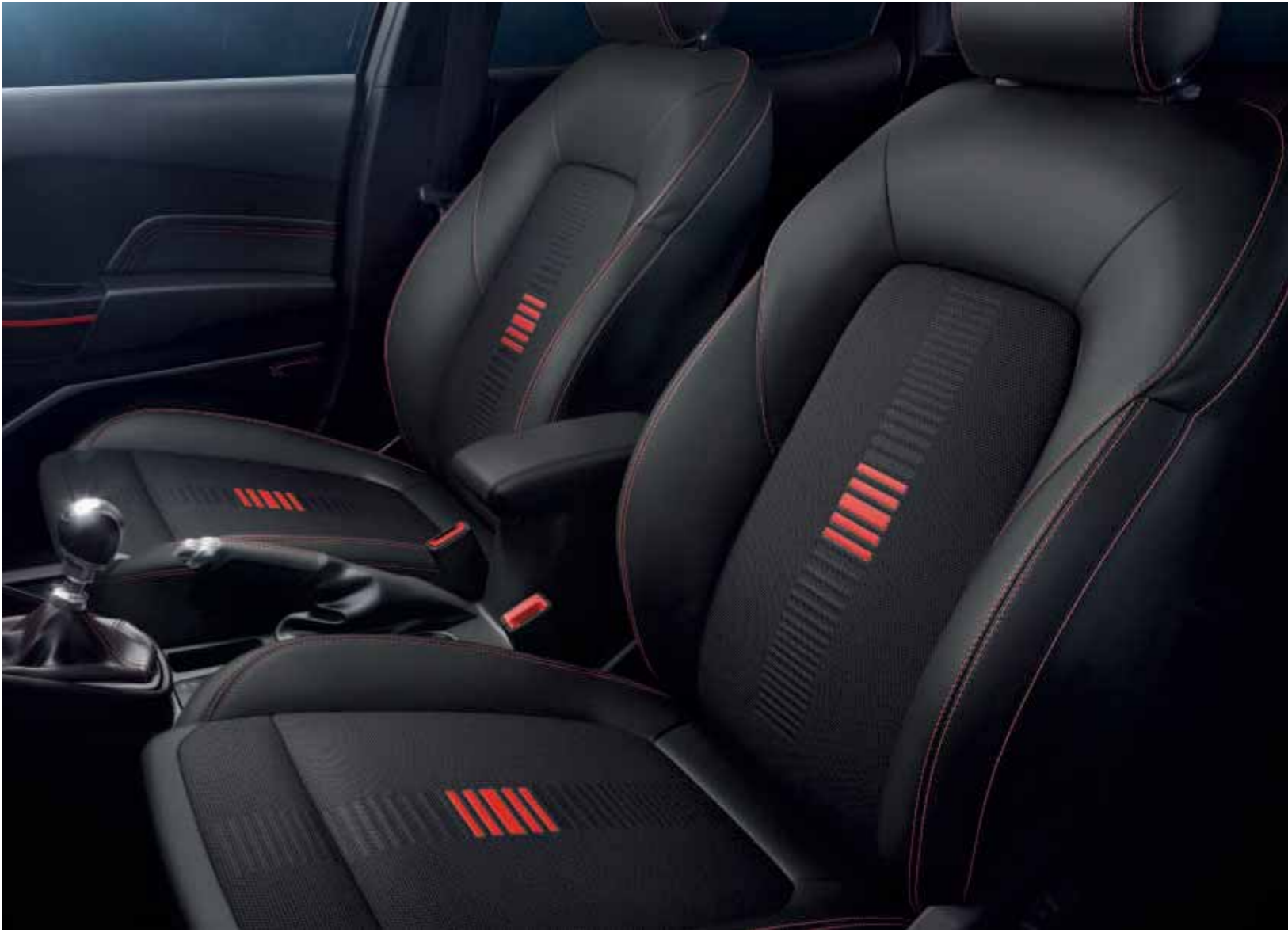
ST-Line X partial leather interior Standard on ST-Line X Red stitching on gaiter, handbrake and floor mats standard from 2019 model year