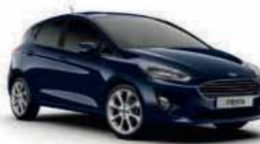
Blazer Blue Standard body colour