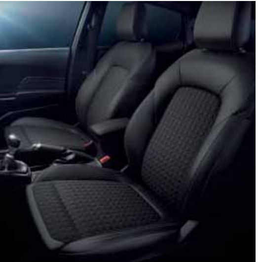
Flagstone Partial leather in Ebony with grey piping for Active X