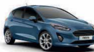
Chrome Blue Premium body colour*