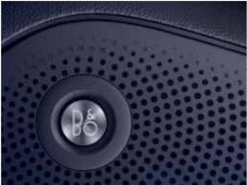
■ B&O Premium audio system (Standard)