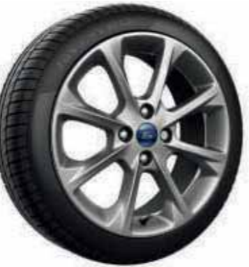
17" 8-spoke, Sparkle Silver alloy wheel (Option on Titanium, B&O Titanium and Titanium X within the 17" Style Pack)