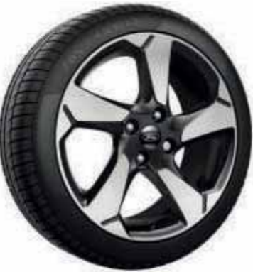
17" 5-spoke Shadow Black machined-finish alloy wheel (Standard on Active B&O)