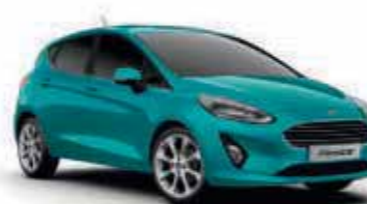
Blue Wave Exclusive body colour*