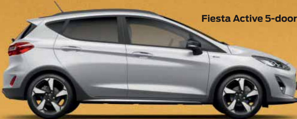
Fiesta Active 5-door

Width: 1,756 mm (with mirrors: 1,941 mm)