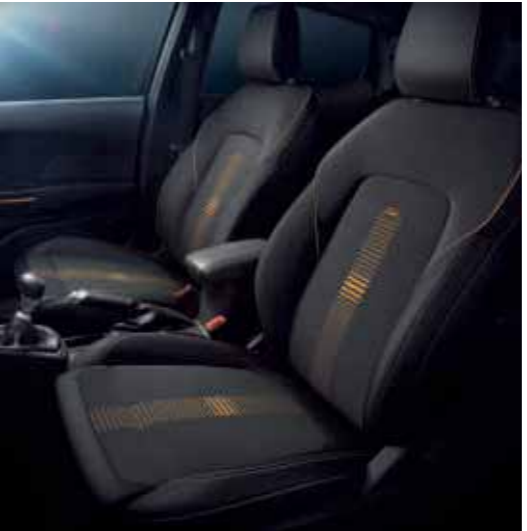
Jean Diamond/Jean Active In Ebony with Luxe Yellow piping for Active B&O