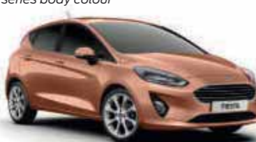
Chrome Copper o Exclusive to B&O PLAY Zetec & Titanium series body colour*