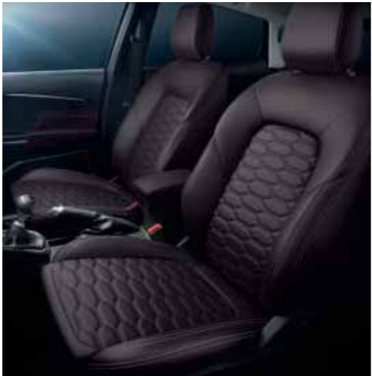
Hexagon Quilted Leather In Black Ruby for Vignale