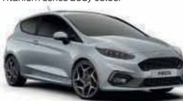
Silver Fox Exclusive to Active & ST body colour*