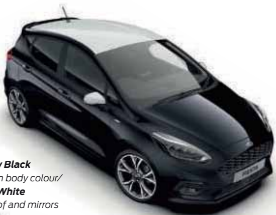
Shadow Black Premium body colour/ Frozen White Solid roof and mirrors