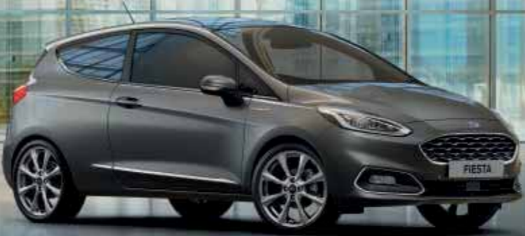
Fiesta Vignale 3-door with panorama roof, Magnetic exclusive body colour and Vignale 18" polished alloy wheels (options at extra cost)