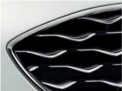
■ Unique Vignale upper grille with chrome surround (Standard)