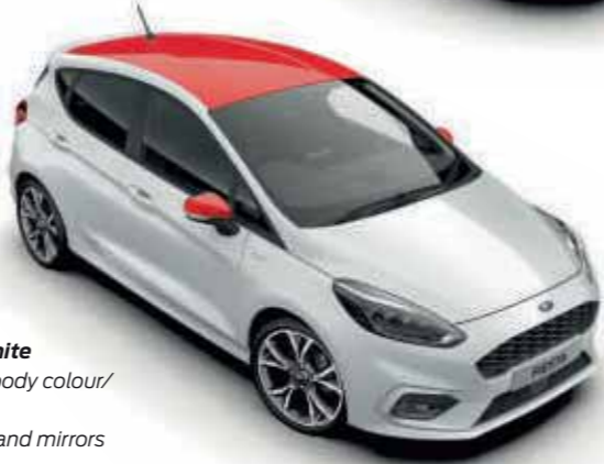
Frozen White Premium body colour/ Race Red Solid roof and mirrors