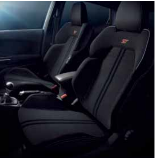
Gozil In Ebony/Blue for ST-2