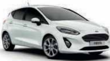
Frozen White Premium body colour*