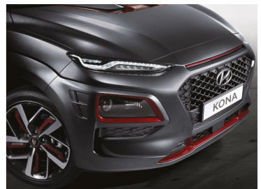
Iron Man Edition Bumper and New LED Daytime Running Lights