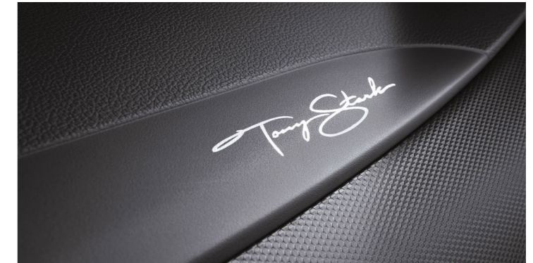
Dashboard Signature - Tony Stark