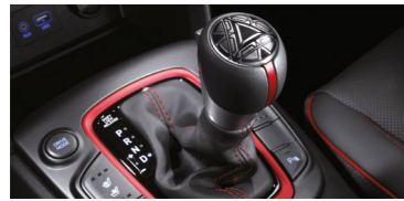
Leather Wrapped Gear Knob

Step inside and be inspired by one of your favourite characters. The spirit of Iron Man is unmistakable from back to front.