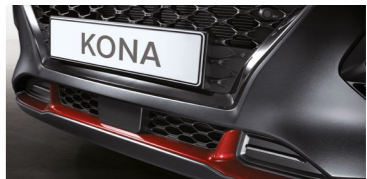
Front Bumper with Red Intake Garnish