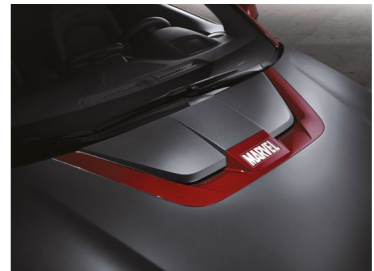
V-shaped Bonnet Bezel with Marvel Logo

With the charisma, style and confidence of the man himself, the Kona Iron Man Edition boasts a huge range of Marvel-inspired features to dial up your passion for action.