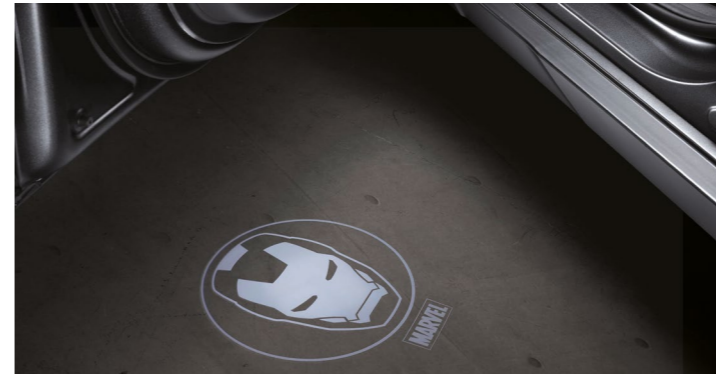
Door Spot Light