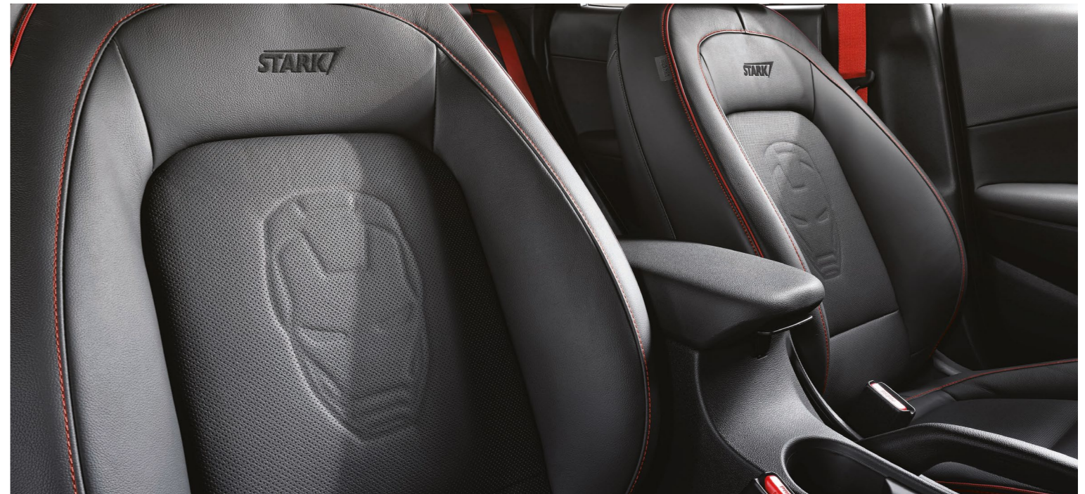
Seat Trim - Leather (Seat Facings only) with Detailing