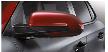
Red Door Mirror

With Matte Grey exterior paint and a Red two-tone roof, mirrors and detailing, the Kona captures Stark's distinctive style. We've also incorporated custom daytime running lights that resemble Iron Man's facemask and eye shape, plus a bespoke V-shaped bonnet bezel with Marvel logo. In the dynamic Kona Iron Man Edition, it's the little touches that make the biggest difference.