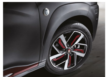
18" Iron-Grip Dual-tone Alloy Wheels