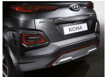
Iron Man Lettering Rear Garnish and Two-tone Skid Plate