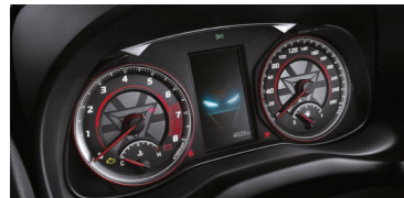
4.2" Driver's Suspension Instrument Cluster with LCD Display