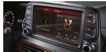
8" Centre Console Display

Take a look at the instrument panel and discover Tony Stark's signature, right next to a unique Iron Man gear shift lever. Be transported into the Marvel universe thanks to a special Head-up Display and colour touchscreen featuring Iron Man visual graphics. With so many features helping you step into character, you just need to add your sense of adventure.