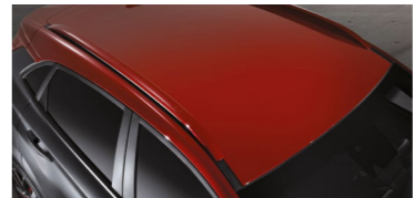
Iron Man Roof Rails