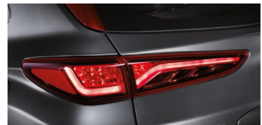
Rear Lights - LED

The Kona Iron Man Edition takes the spirit of Tony Stark and brings it alive in every feature.