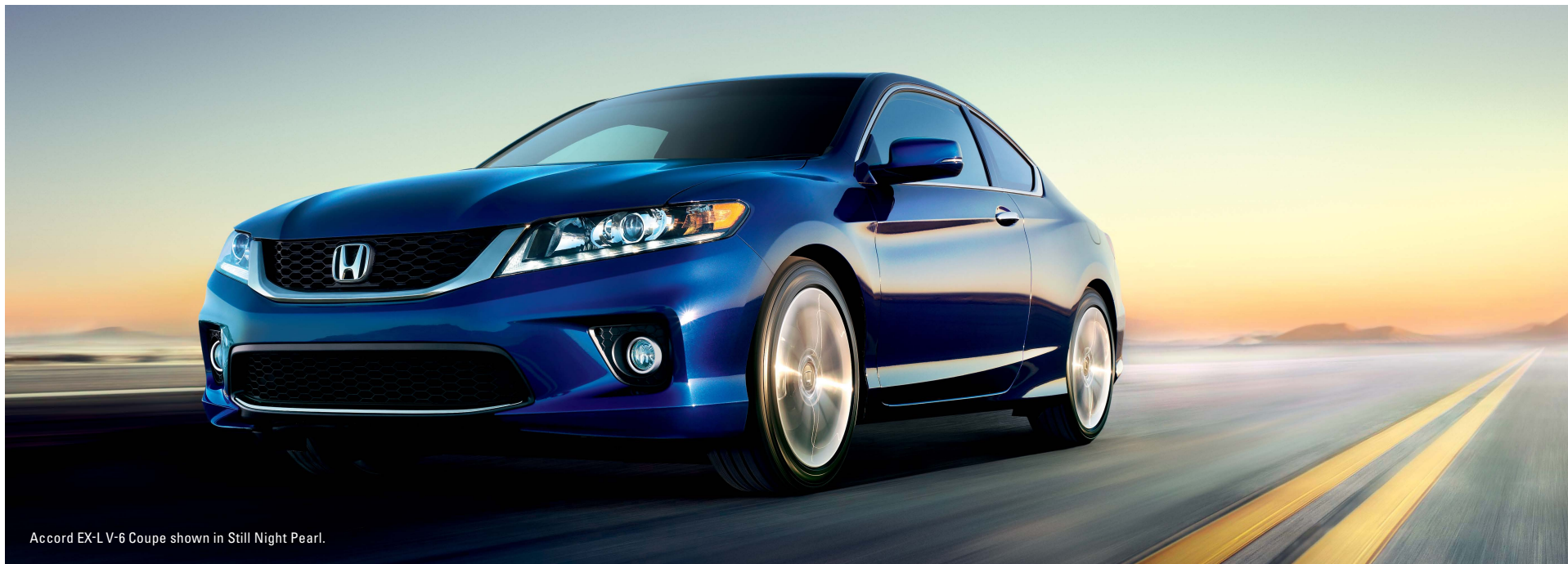
Accord EX-L V-6 Coupe shown in Still Night Pearl.