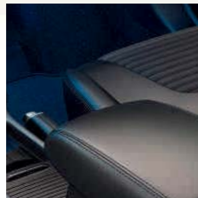
● Partial leather seat trim