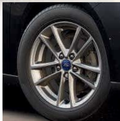
● 16" alloy wheel