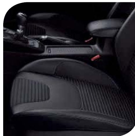
Capretto/Groove partial leather in Charcoal Black for Titanium X