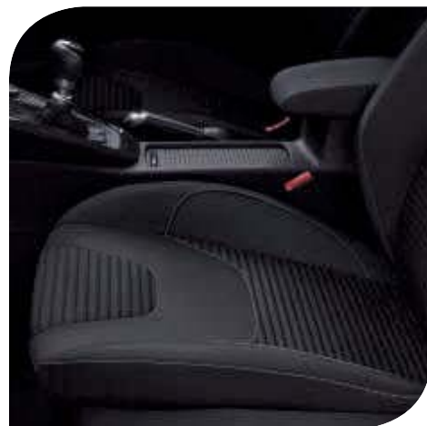
Groove/Lux in Dark Charcoal Black for Titanium