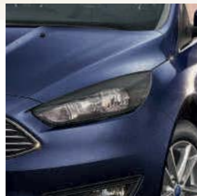
● Halogen projector headlights with black headlight bezel