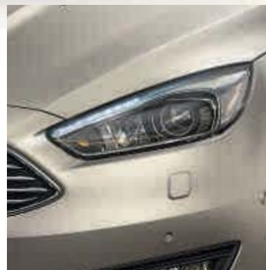
● Bi-Xenon headlights