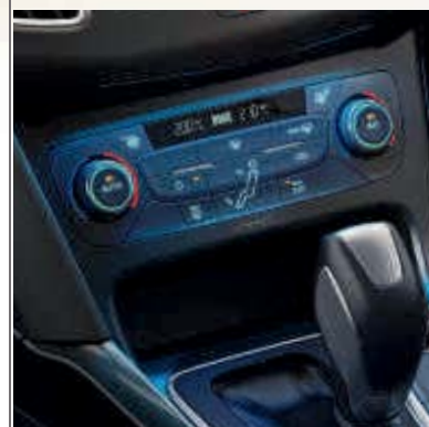
● Dual-zone Electronic Automatic Temperature Control (DEATC)