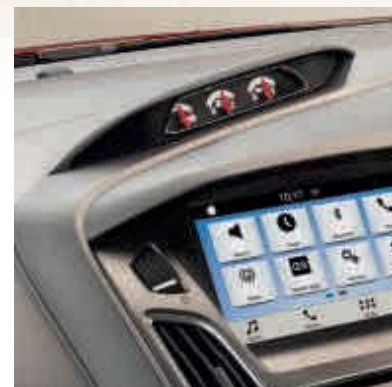
● ST unique auxiliary dials Interior shown opposite is ST-3