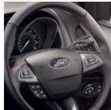
● Leather-trimmed steering wheel with Paddle shifters on automatic transmissions