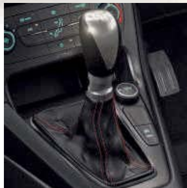
● ST-Line Red & Black