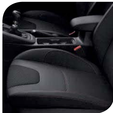
View in Dark Charcoal Black with red stitching for ST-Line