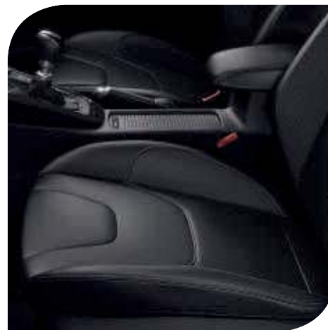
Capretto full leather in Charcoal Black optional at extra cost for Titanium and Titanium X

ST Recaro seat See the ST Range brochure for more information on series and features.