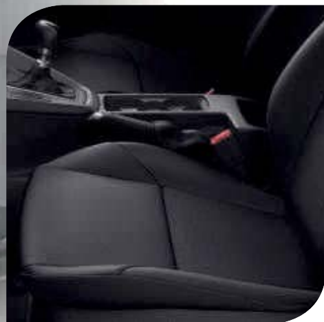
Twist In Dark Charcoal Black for Style

The look and feel of interior materials plays a large part in appreciating the overall driving experience. That's why great care has been taken in designing and crafting the trims for your Ford Focus.