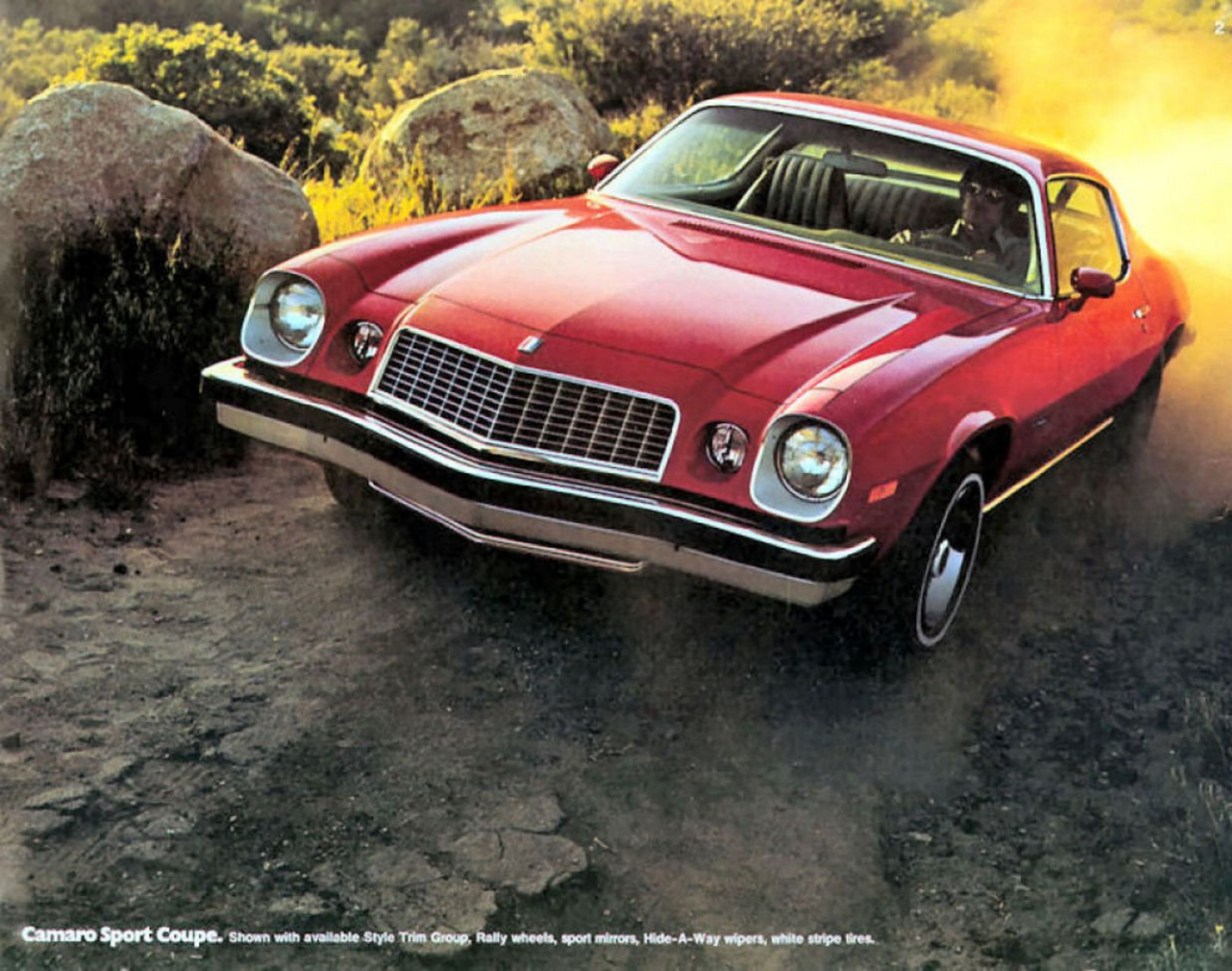
Camaro Sport Coupe. Shown with available Style Trim Group, Rally wheels, sport mirrors, Hide-A-Way wipers, white stripe tires.