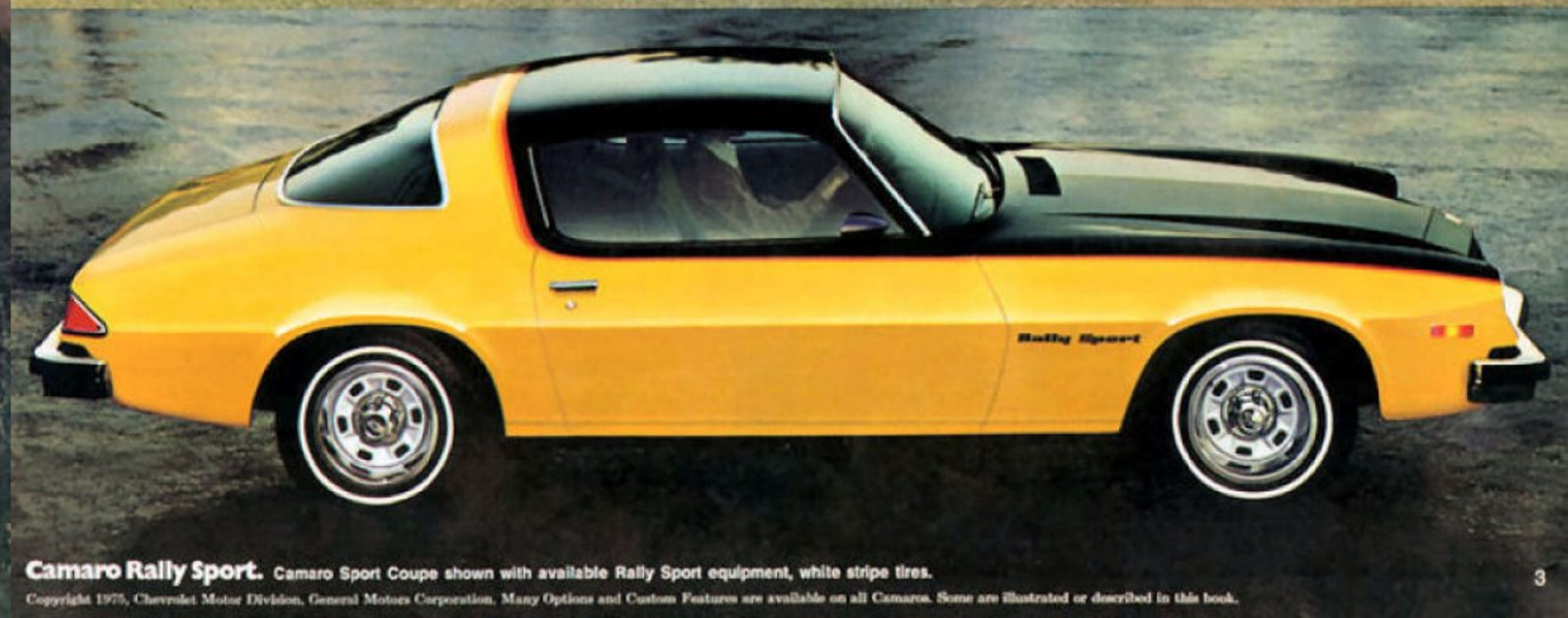
Camaro Rally Sport. Camaro Sport Coupe shown with available Rally Sport equipment, white stripe tires.

Copyright 1975, Chevrolet Motor Division, General Motors Corporation. Many Options and Custom Features are available on all Camaros. Some are illustrated or described in this book.