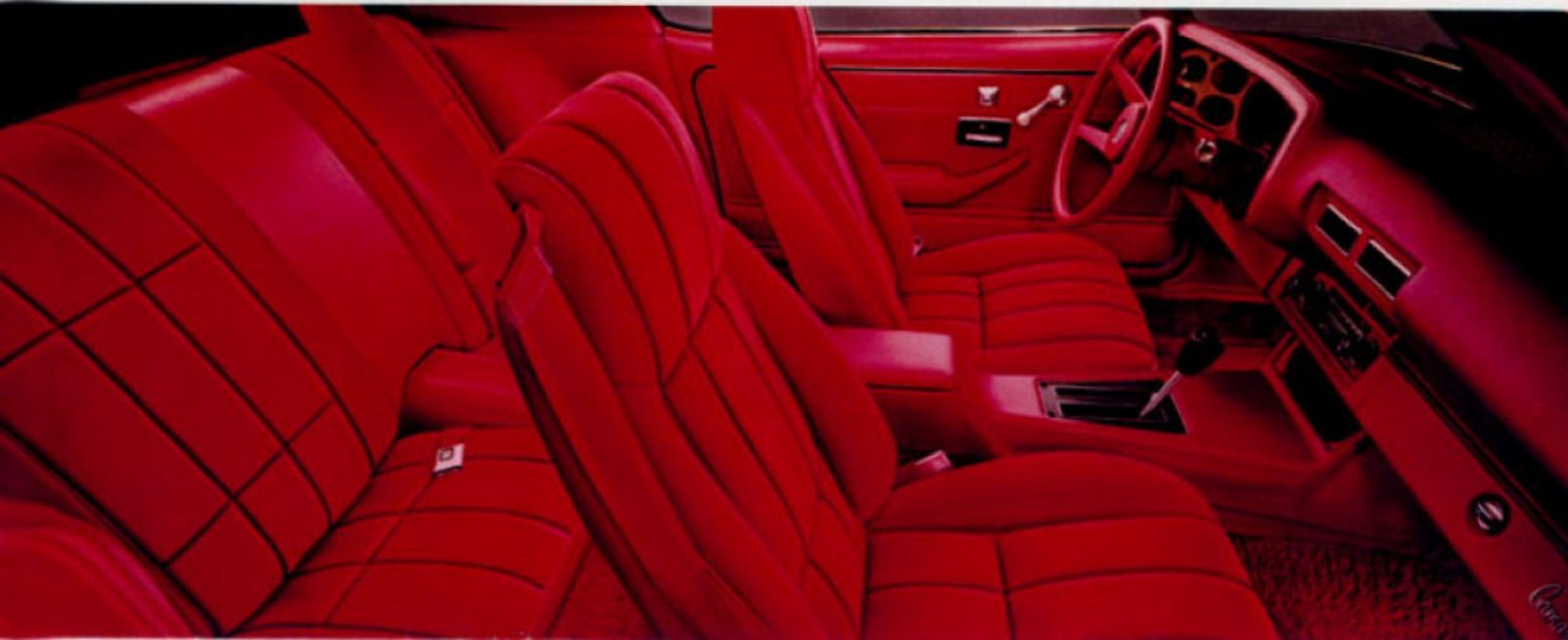
Camaro Sport Coupe interior in sport cloth-and-vinyl.