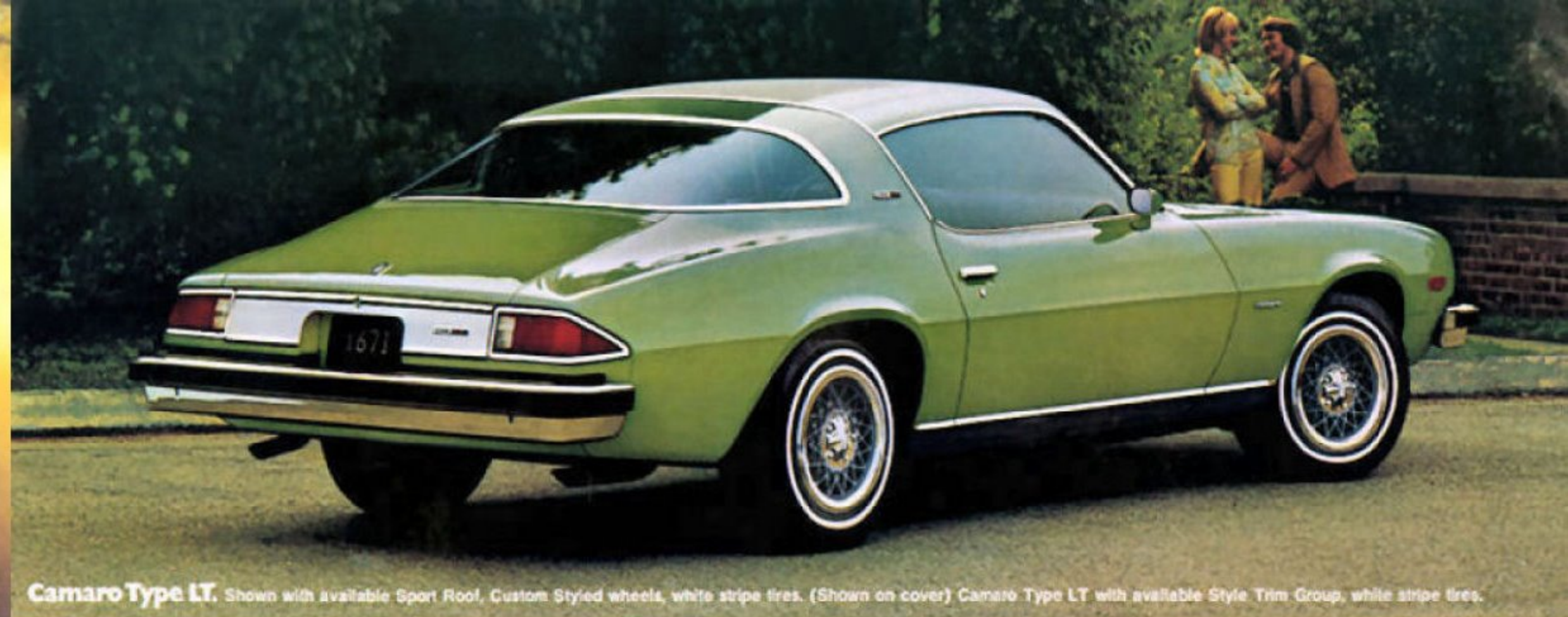
Camaro Type LT. Shown with available Sport Roof, Custom Styled wheels, white stripe tires. (Shown on cover) Camaro Type LT with available Style Trim Group, white stripe tires.