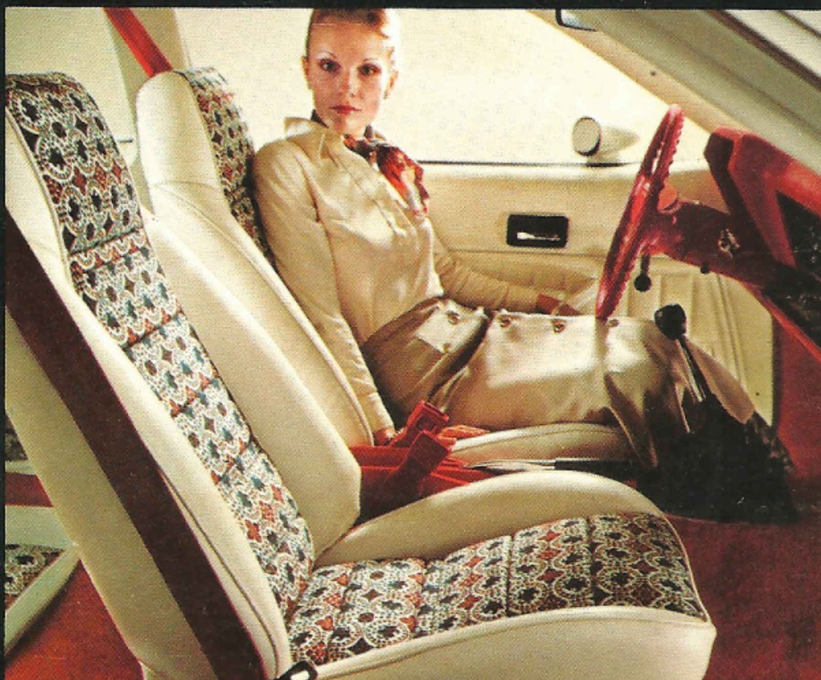
Monza Towne Coupe with new Heritage interior trim.