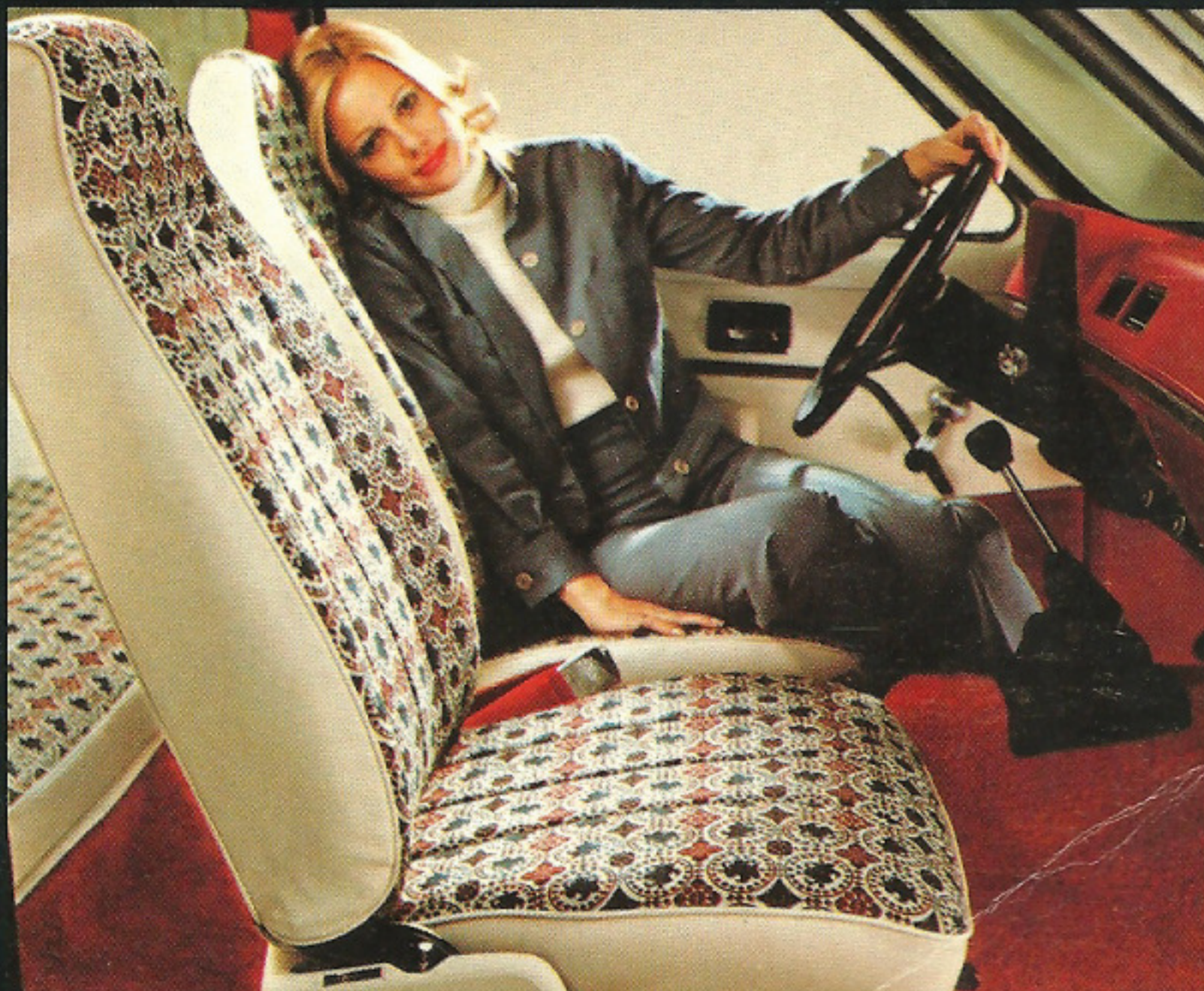
Chevette Coupe with new Heritage interior trim.