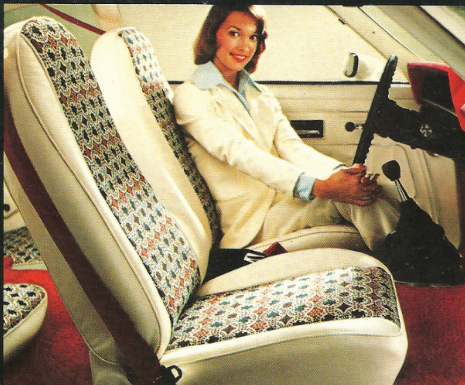
Vega Hatchback with new Heritage interior trim.

Order units equipped with the Heritage interior now! They're sure to attract attention in your showroom, and can be the focal point of any Bicentennial promotions you may be planning.