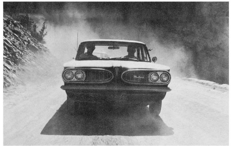
TEMPEST CLIMBS PIKES PEAK! The Tempest displayed championship form as it hit the nation's geographical high spots. Weather and atmospheric changes caused no difficulty.

Most important, they say, is that the Tempest takes a solid grip on the road whether it's carrying a full load or just the driver. The reason? Again, it's near perfect 50-50 balance.