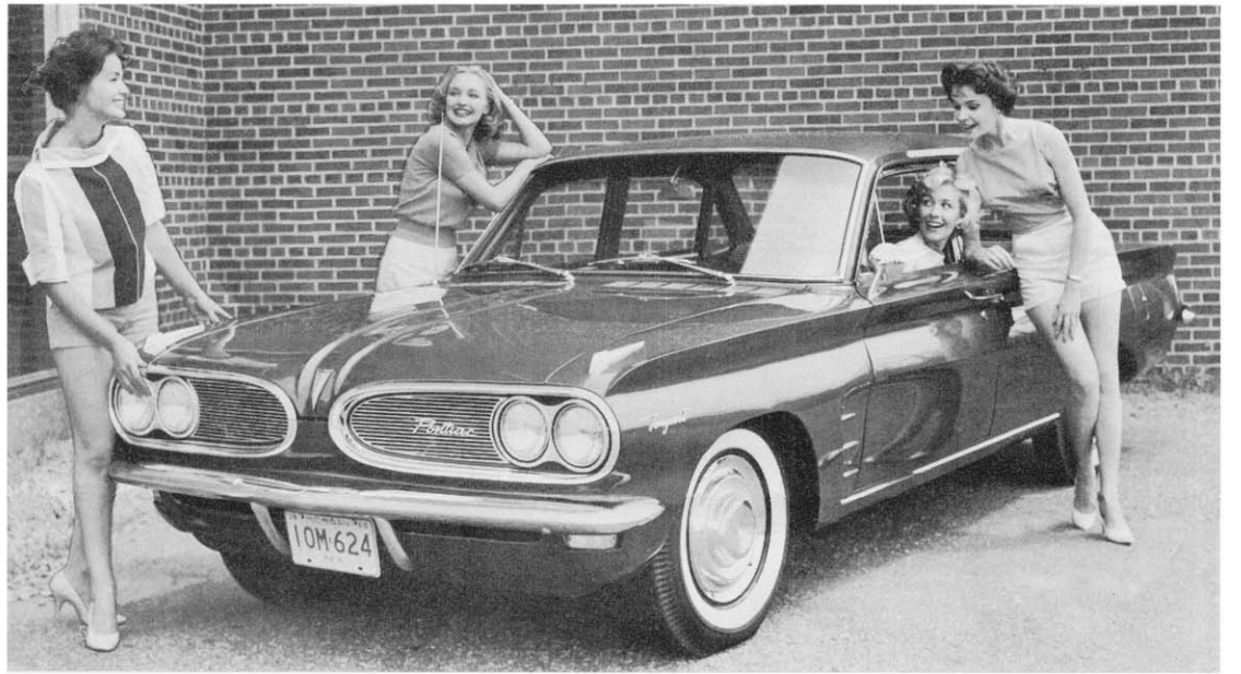
STARLETS FALL IN LOVE at first sight with the Tempest as it arrives on movie lot for preview. The Tempest became the hot topic at the studio. Note trim lines, superb construction.

One test driver remarked: "That baby has a stance like a halfback and moves like a ballet dancer."