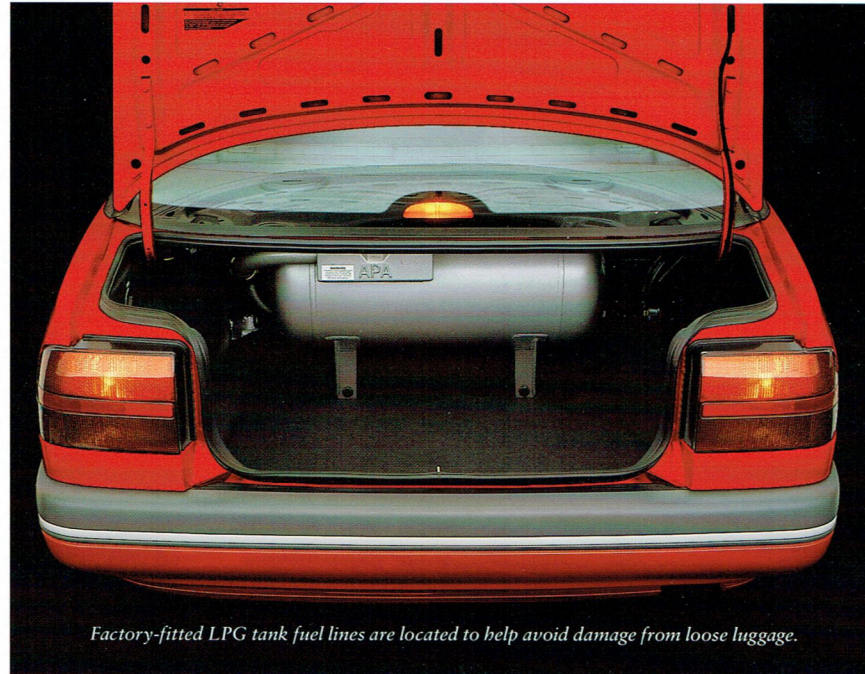
Factory-fitted LPG tank fuel lines are located to help avoid damage from loose luggage.