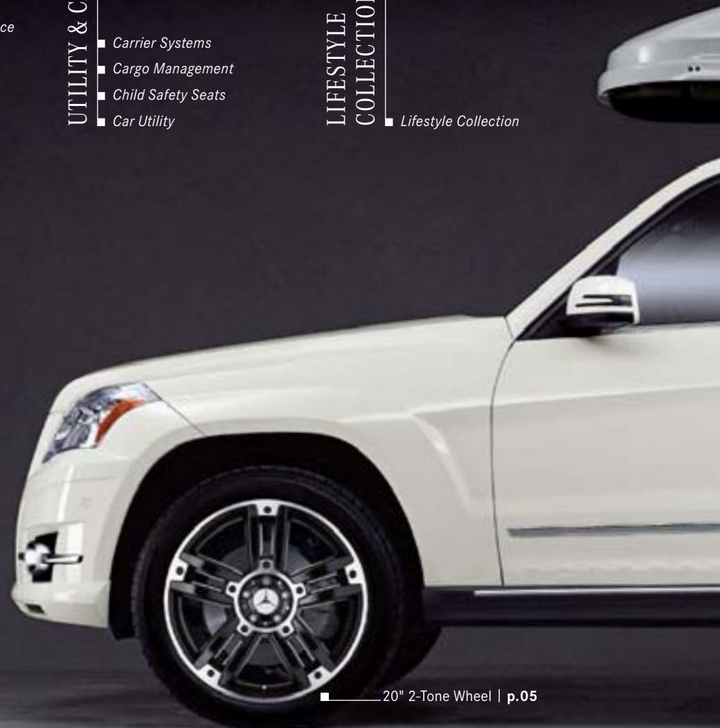
■ 20" 2-Tone Wheel | p.05