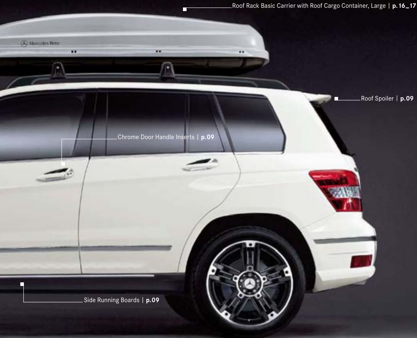
Roof Rack Basic Carrier with Roof Cargo Container, Large | p. 16_17