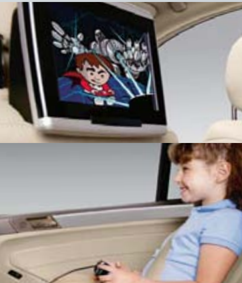
shown on M-Class

Your passengers are entertained and because DVD audio plays over wireless headsets, the driver can concentrate on driving with fewer distractions.