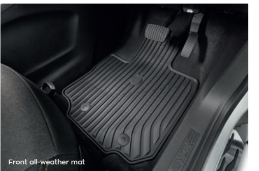
Front all-weather mat