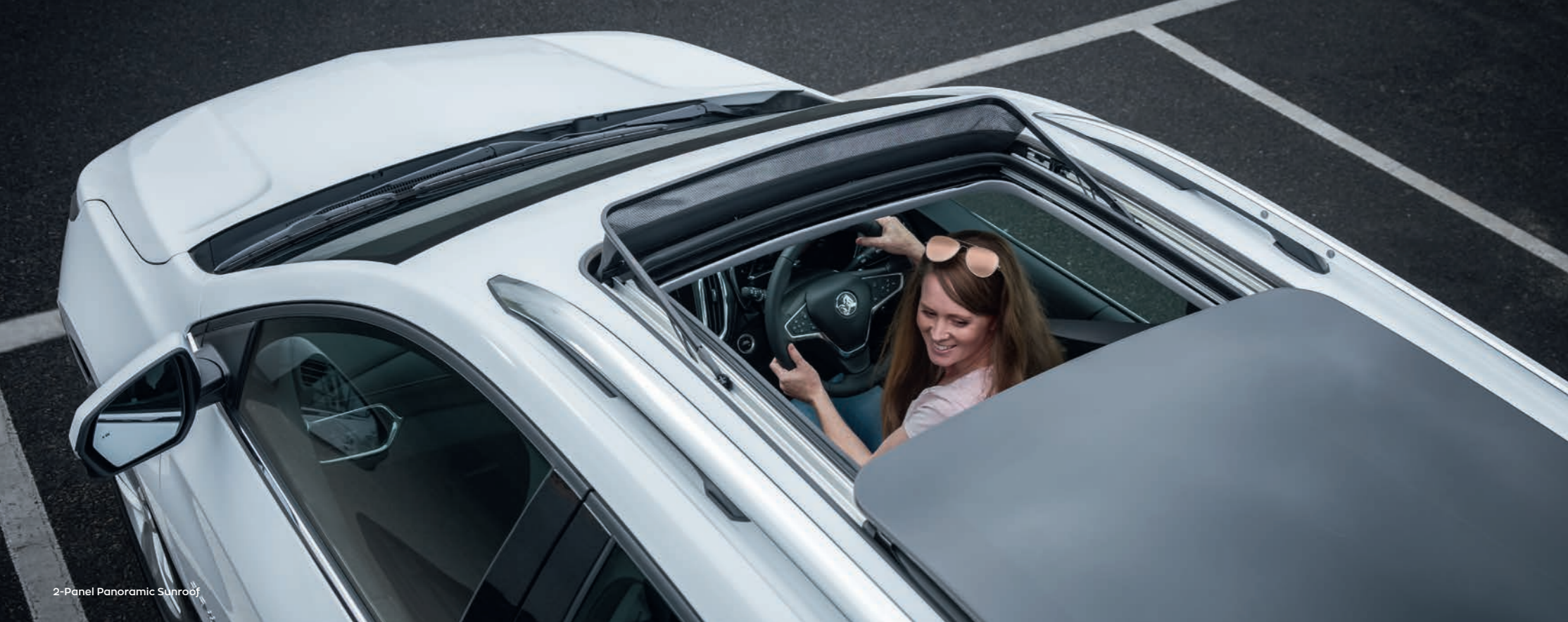
2-Panel Panoramic Sunroof