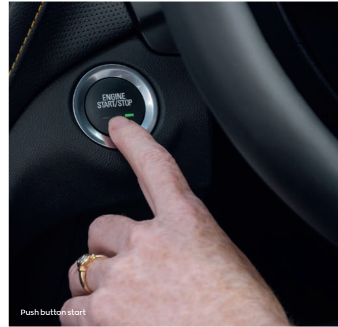
Push button start