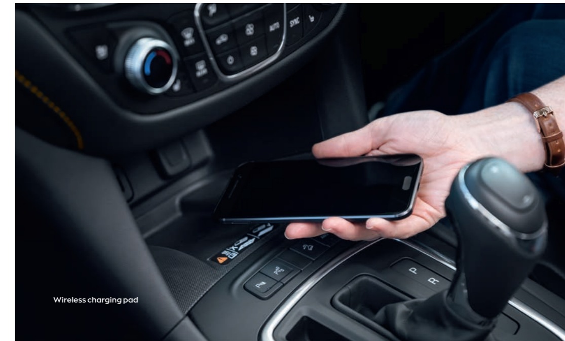
Wireless charging pad