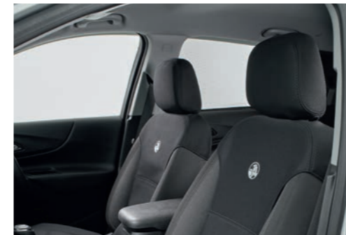
Front seat covers