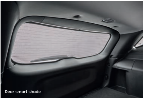
Rear smart shade