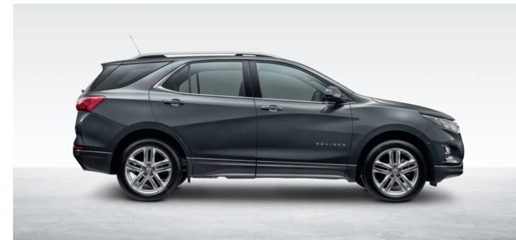
Son of a Gun Grey