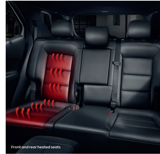
Front and rear heated seats