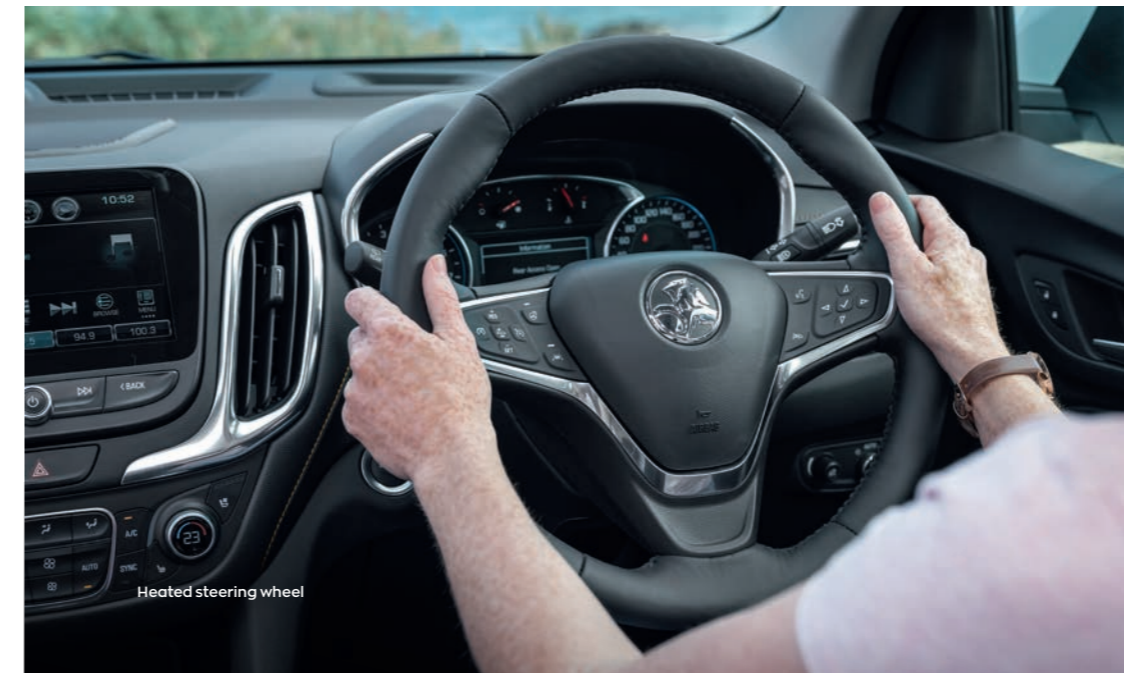
Heated steering wheel