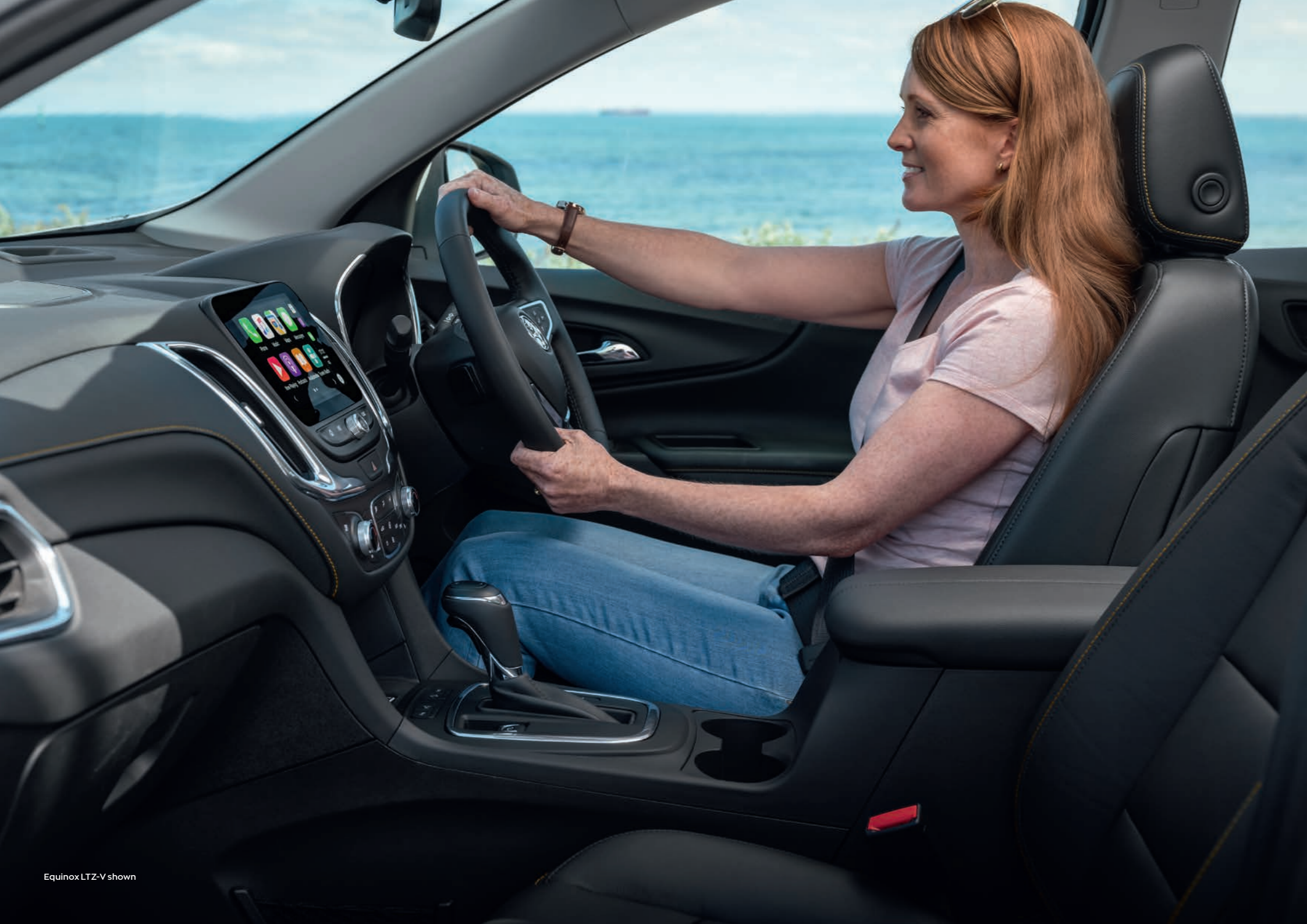
Equinox LTZ-V shown