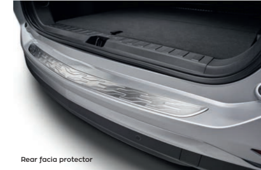
Rear bonnet protector