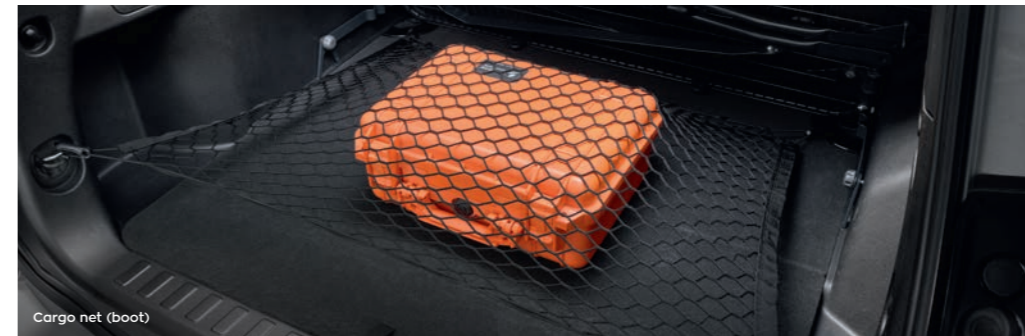
Cargo net (boot)