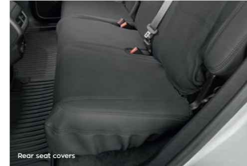
Rear seat covers