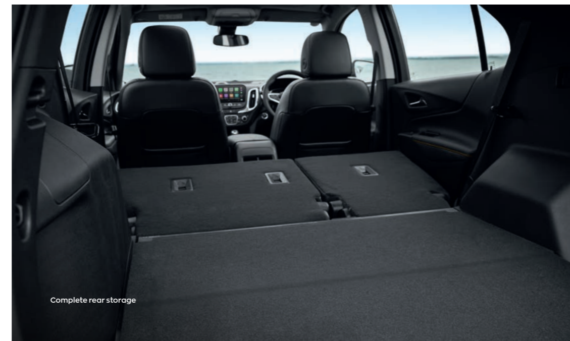
Complete rear storage