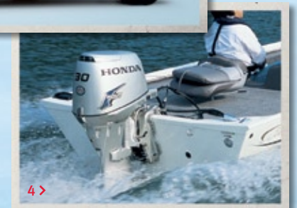
1 > ASIMO™, the advanced, life-assisting humanoid robot 2 > The high-speed, fuel-efficient HondaJet 3 > Honda's advanced safety research and development facility in Tochigi, Japan 4 > First manufacturer of a full line of cleaner 4-stroke outboard motors 5 > The world's first motorcycle safety airbag 6 > The Zero-Emission Honda FCX™ Clarity