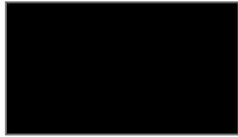
Black Noir Pearl

Our vivid palette of exterior colours is the perfect way to complete your Sonata. Explore the options and choose the one that best reflects your personal style.