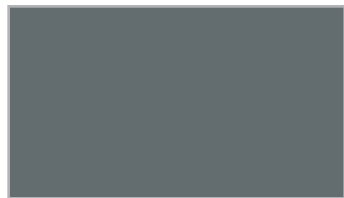
Harbour Grey Metallic