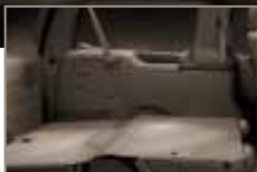
Silhouette Premiere in Mocha Two-Tone leather trim.