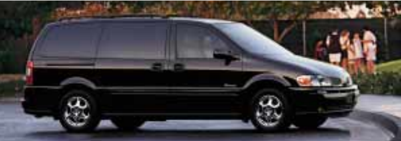
Silhouette Premiere in Black Onyx. Shown with available equipment.

Powertrain and Chassis • 3400 SFI V6 engine • Electronic 4-speed automatic transmission with overdrive • Front-wheel drive • Independent front MacPherson strut/rear twist axle and coil spring suspension • Reduced effort power rack-and-pinion steering • Maintenance-free battery • Stainless steel exhaust • Touring suspension