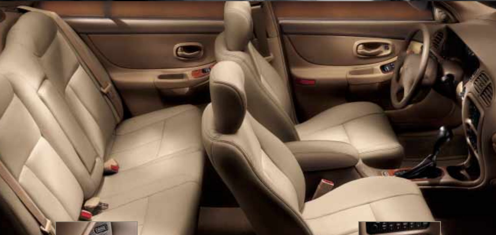
Intrigue GLS with leather-trimmed seating in Neutral.

WHILE INTRIGUE TAKES CARE OF THE ROAD, IT TAKES EVEN BETTER CARE OF YOU.