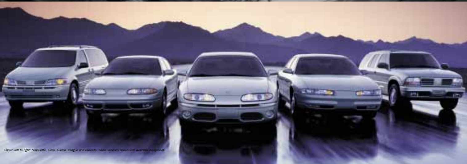
Shown left to right: Silhouette, Alero, Aurora, Intrigue and Bravada. Some vehicles shown with available equipment.

Each of the five Oldsmobile vehicles shares a common strand of automotive DNA. You can see the family resemblance in the tautly drawn lines. And you'll feel it from the first turn of the wheel. Responsive engines. Agile suspensions. Smooth road manners. An unexpected level of sophistication. Whatever your choice, Oldsmobile has five unique ways to move you.