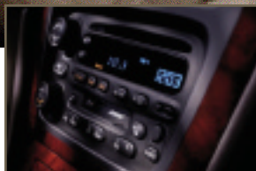
Aurora 3.5 interior in Neutral with Dark Neutral Accents. Shown with available equipment.

With standard leather-trimmed seating areas, burlled walnut accents and the standard OnStar® service, Aurora surrounds you with luxury and peace of mind.