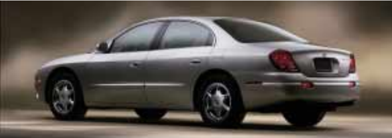
Aurora 4.0 in Sterling with available chrome wheels.