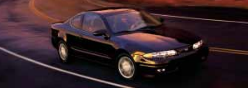
Alero GL Coupe in Black Onyx. Shown with available equipment.

Exterior • Rust- and dent-resistant steel body panels • 5-mph bumpers • Spring-away outside rearview mirrors (black on GX; body-colored on GL and GLS) • Rear window grid antenna