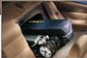
Alero GLS Sedan with leather-trimmed seating in Neutral.

With available leather-trimmed seating areas, room for five and an airy, well-appointed cabin, Alero takes the dull out of everyday driving.