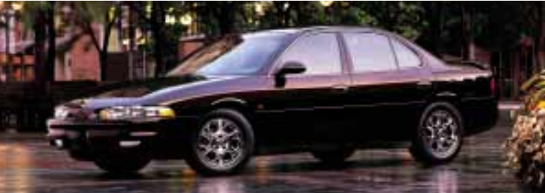
Intrigue GLS in Black Onyx. Shown with available Precision Sport Package.

Exterior • “Liquid crystal” headlamps and taillamps • Tinted windows with solar-control windshield and rear window glass • Rear window grid radio antenna • Dual power foldaway outside mirrors (black on GX; body color on GL and GLS) • Gas-charged hood and non-intrusive trunk struts • Body-color side moldings