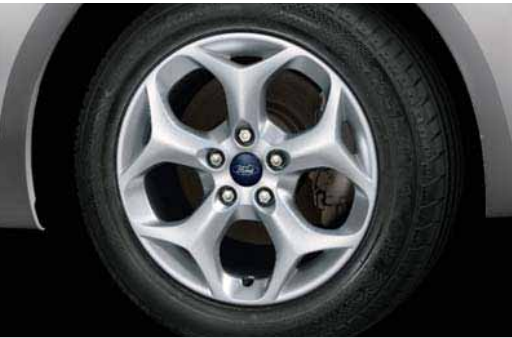
16" 5-spoke 'Y-design' alloy wheel [D2XD1] (Only available with Style Sport Pack)