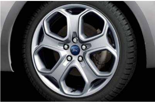
18" 5-spoke alloy wheel [D2UL1] (Only available with Titanium Sport Pack)