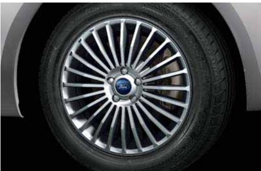
16" multi-spoke alloy wheel [D2XVF] (Standard on Titanium)