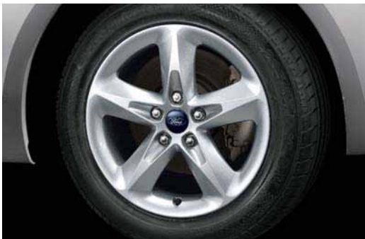
16" 5-spoke alloy wheel [D2XAL] (Standard on Zetec)