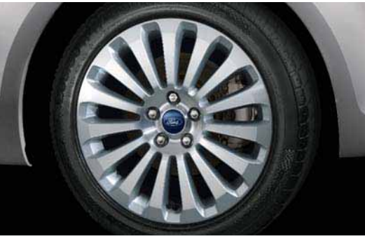
17" multi-spoke alloy wheel [D2YB7] (Accessory)