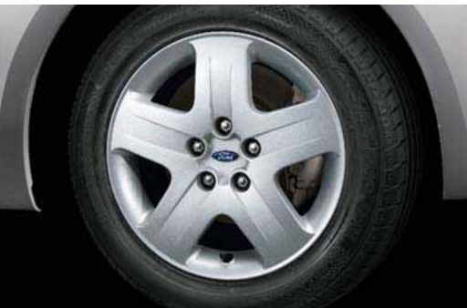
16" 5-spoke 'Design' wheel [D5ABN] (Standard on Style)