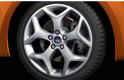
18" 5-spoke alloy wheel [D2UBJ] (Standard on ST)