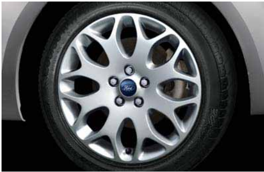
17" 8-spoke alloy wheel [D2YBU] (Only available with Zetec Sport Pack)