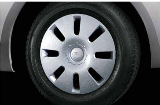
15" 8-spoke wheel cover design [D5AAB] (Standard on Studio)