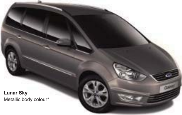
Lunar Sky Metallic body colour*