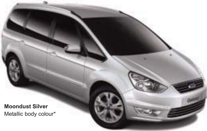
Moondust Silver Metallic body colour*