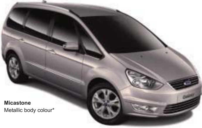
Micastone Metallic body colour*