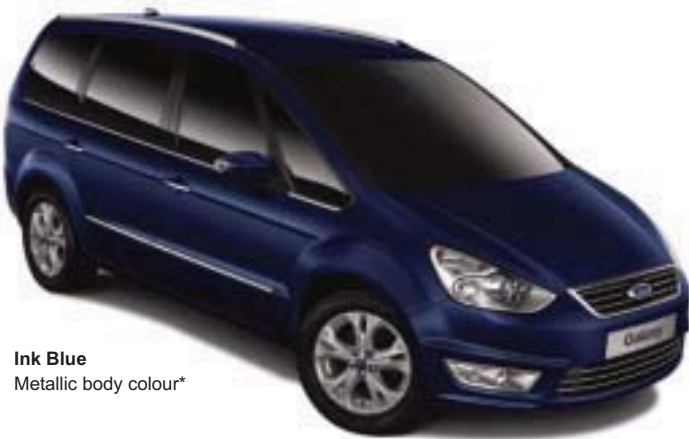
Ink Blue Metallic body colour*