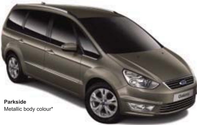
Parkside Metallic body colour*