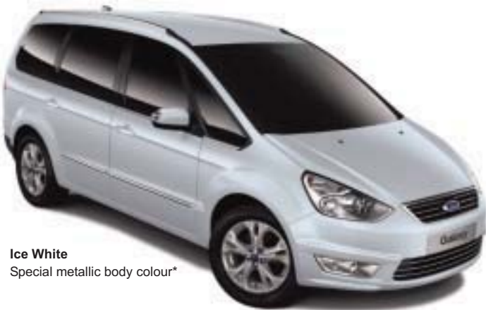
Ice White Special metallic body colour*