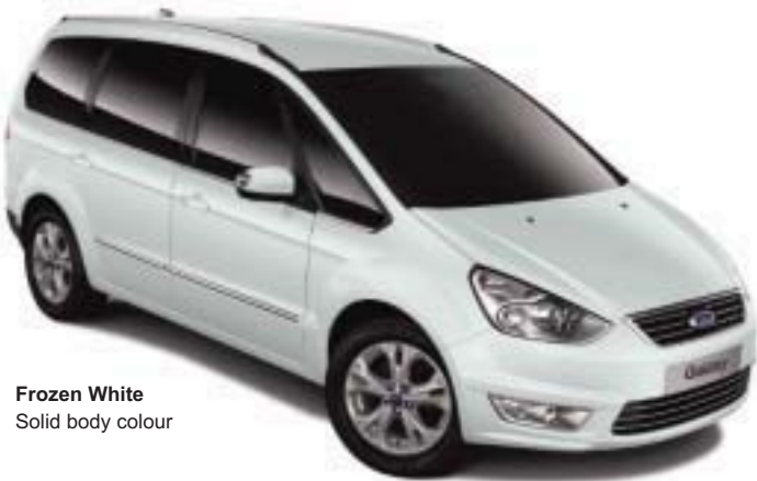
Frozen White Solid body colour