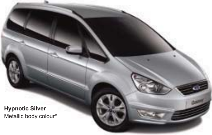
Hypnotic Silver Metallic body colour*