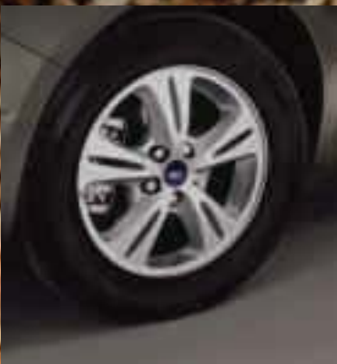
16" 5x2-spoke sparkle silver-painted alloy wheel (Standard on Zetec; also available as an accessory)