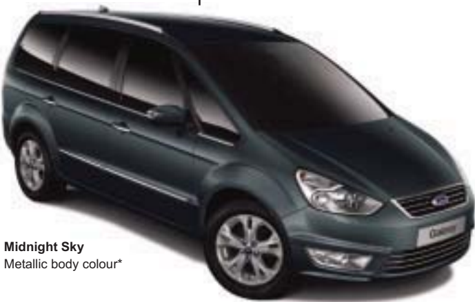
Midnight Sky Metallic body colour*