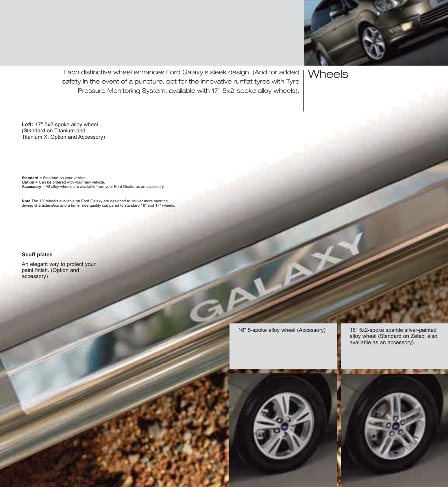
16" 5-spoke alloy wheel (Accessory)

An elegant way to protect your paint finish. (Option and accessory)