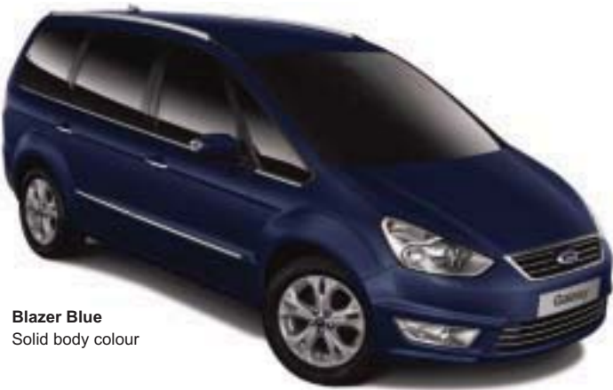
Blazer Blue Solid body colour