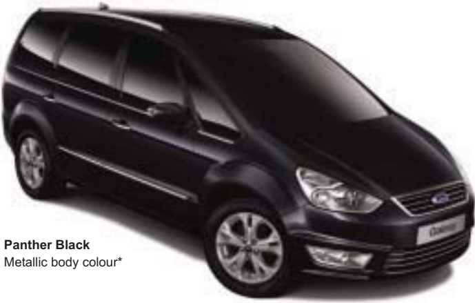
Panther Black Metallic body colour*