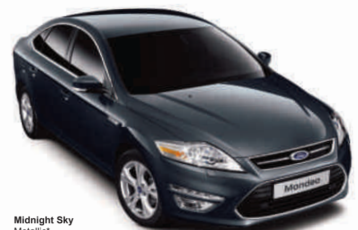
Midnight Sky Metallic*