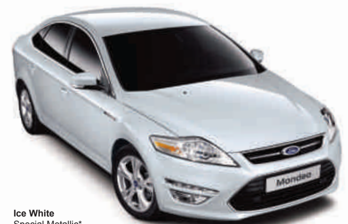
Ice White Special Metallic*