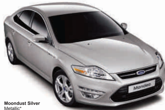
Moondust Silver Metallic*