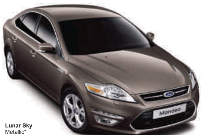
Lunar Sky Metallic*