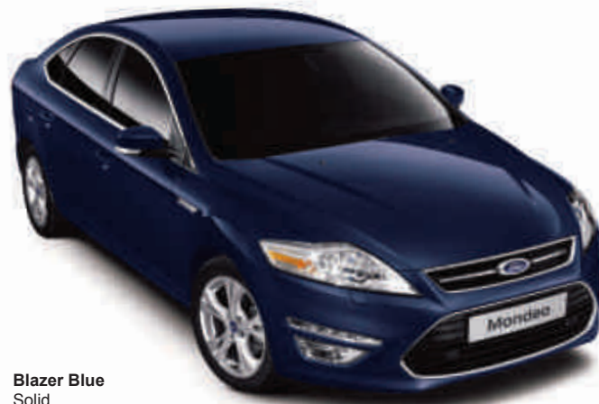
Blazer Blue Solid