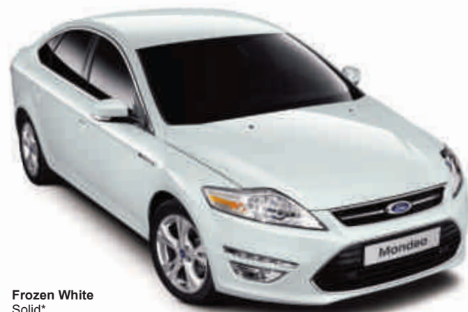
Frozen White Solid*

Choosing the colour and trim for your Ford Mondeo Business Edition is a defining moment – and an enjoyable one, too. You'll know what's right in an instant.