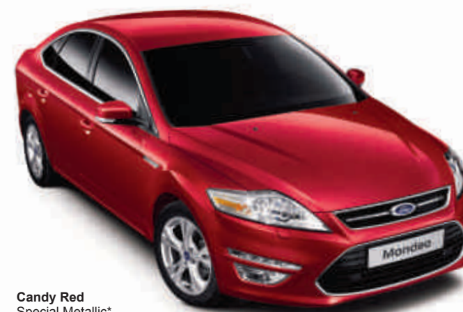
Candy Red Special Metallic*

Note The car images used are to illustrate body colours only and may not reflect current specification. Colours and trims reproduced within this brochure may vary from the actual colours, due to the limitations of the printing processes used.