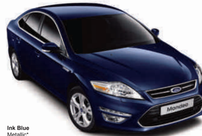
Ink Blue Metallic*