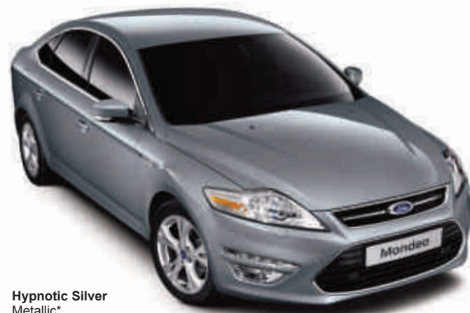
Hypnotic Silver Metallic*