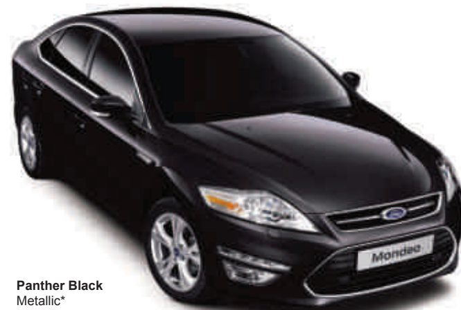
Panther Black Metallic*