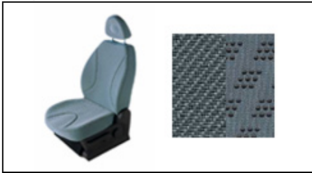
Metropolis Ice Blue/Chestnut