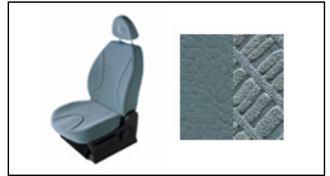
Metropolis Ice/Blue Chestnut Leather