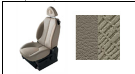
City Sand/Chestnut Leather