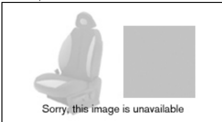
City Graphite Leather