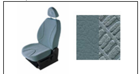
City Ice/Blue Chestnut Leather