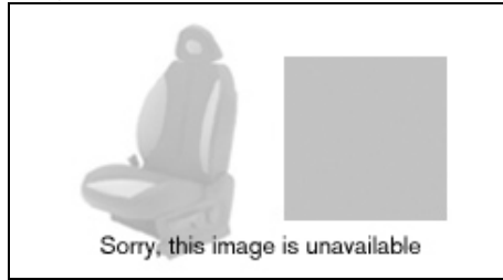
Metropolis Graphite Leather