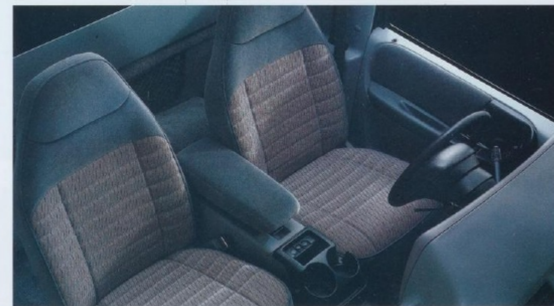
Ranger 4x4. And the XLT SuperCab interior in Opal Grey. Some equipment shown is optional.

And what's more, the Ranger 4-wheelers have a distinctively dynamic style all their own, with new larger-diameter tires, redesigned fog lamps (available as an option), and stylish wheel flares.