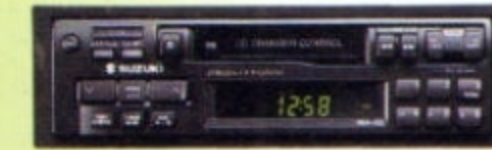
Listen to the Xtraordinarily fine acoustics of the high-powered, 100-watt (25x4) Suzuki by Alpine stereo system, standard on the 4WD. It'll be music to your ears.

Look at the sporty, ergonomically-designed dash, with tachometer and tripmeter. Cruise control adds to a relaxing, easy ride on the 4-wheel drive. Settle back into brightly-colored cloth seats and matching door panel inserts. Complete the aesthetics with full carpeting. Perfect.