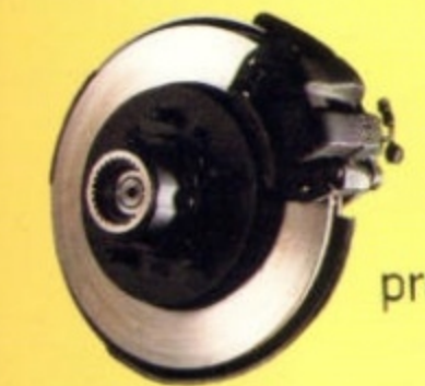
Anti-lock brakes on the X-90 reduce skidding and promote straight, smooth stops in bad weather.

Xceptional fun with safety in mind. In the X-90, airbags supplement the 3-point seat belts and head restraints, so both driver and passenger are better protected from a moderate to severe frontal impact. Front and rear crumple zones have been designed to progressively absorb the energy of an impact. It has side impact protection. And, laminated windshield safety glass, tempered side and rear safety glass, as well as a breakaway inside rearview mirror, help reduce the likelihood of glass shattering and injuring occupants. An energy-absorbing steering column and instrument panel are in place to soften passenger impact. While daytime running lights increase visibility. Xtremely well built for security.