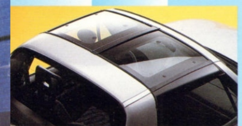
Fully covered or exposed to the sun and air, the T-top on the X-90 makes travel fun and practical, too. The T-top panels store conveniently in the trunk.

Welcome to the '90's. Fun is becoming more daring than ever. Doing more and being more are in.