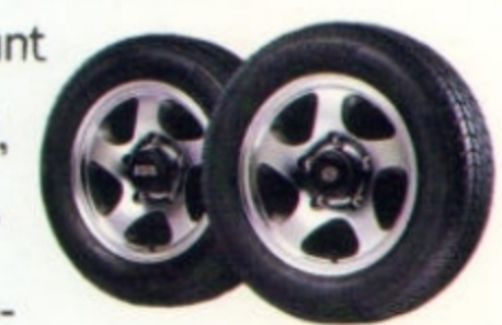
These classy, light & strong, aluminum alloy wheels are standard equipment on the 4WD.

This isn't just another hip vehicle. It's the only "sporty" utility vehicle around. With a T-top that lets in the sun and air and an aggressive 1.6-liter, 16-valve, SOHC engine that means plenty of power. You won't find anything else on the road like the X-90. The T-top provides an open-air feel while the 4x4 takes it where you want to explore. Plus, the X-90 has all the Xtras for power and safety. Standard 5-speed manual and, on the 4-wheel drive model, an optional 4-speed automatic transmission. Also standard are power steering and 4-wheel anti-lock brakes. It has a center high-mounted stop lamp incorporated into the rear spoiler. And a right-now, '90's look. Just glimpse at the tinted glass, color-