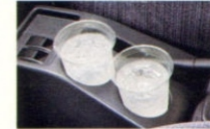
There's plenty of room for refreshments in the dual cup holders located in the center console.

A security alarm system on the 4-wheel drive helps to protect this treasure from harm, while power windows and door locks add to the fun and pizzazz on both X-90 models. It also has a rear window defogger to keep the scenery clear and crisp.