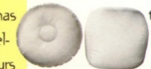
The X-90 comes with standard dual airbags, a safety feature that supplements the 3-point seatbelts. Remember to always wear your seatbelt. Do not install a rear-facing child restraint in the front passenger seat.

So, take it out to the seashore and run it along the sand. Take it down that path less travelled and find out what it has to offer. Move it through city traffic. Take the dog to the beach. Make it a 4-wheel-drive sleigh in ski country. And know that Suzuki is always working hard to make yours a safer driving Xperience.