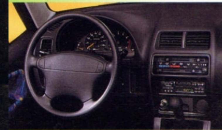
A sporty, ergonomically-designed dash brings a touch of class and more to the interior of the X-90.

But don't stop there. Rest your refreshments in the dual cup holders on the center console. On the 4WD, a high-powered, 100-watt (25x4) Suzuki by Alpine stereo system is incredible. Look for a very happy face in the passenger-side vanity mirror. And, when it does need gas, which isn't often, there's a locking fuel filler door.