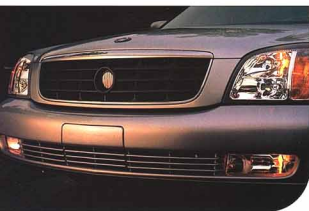
Night Vision's sensor/lens is located in the center of the grille for a clear view of the road ahead. The sensor is weather-resistant and unaffected by normal dust and road conditions.

AMONG ALL THE WORLD'S VEHICLES, ONLY DTS AND DHS OFFER YOU THE SAFETY ADVANTAGES OF NIGHT VISION. NIGHT VISION USES INFRARED SENSING TECHNOLOGY TO ALLOW YOU TO SEE UP TO FIVE TIMES FARTHER THAN YOUR LOW-BEAM HEADLAMPS CAN REACH. IT ALL BEGINS WITH A CAMERA-LIKE SENSOR IN THE GRILLE THAT READS THE "HEAT SIGNATURE" OF THE SCENE AND TRANSLATES IT INTO A VIDEO IMAGE THAT IS PROJECTED ONTO YOUR WINDSHIELD THROUGH A HEAD-UP DISPLAY ATOP THE INSTRUMENT PANEL. TO YOU, IT APPEARS TO FLOAT ABOVE THE HOOD. IT QUICKLY BECOMES A NATURAL CHECKPOINT. IN TIME, IT BECOMES INDISPENSABLE. A DEMONSTRATION CAN BE VIEWED AT CADILLAC.COM.